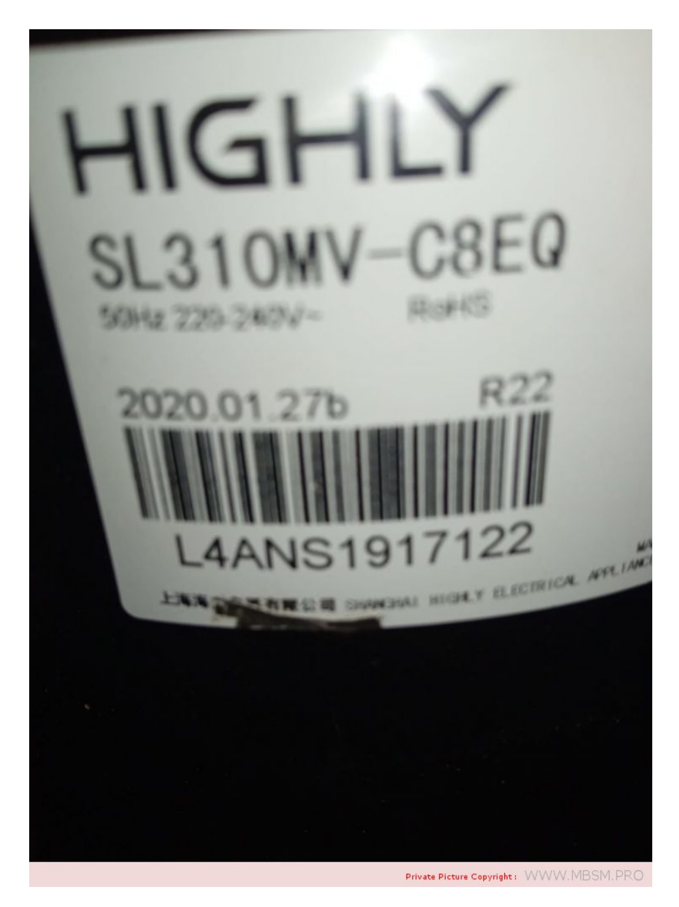
HIGHLY R22 FIXED SPEED AIR