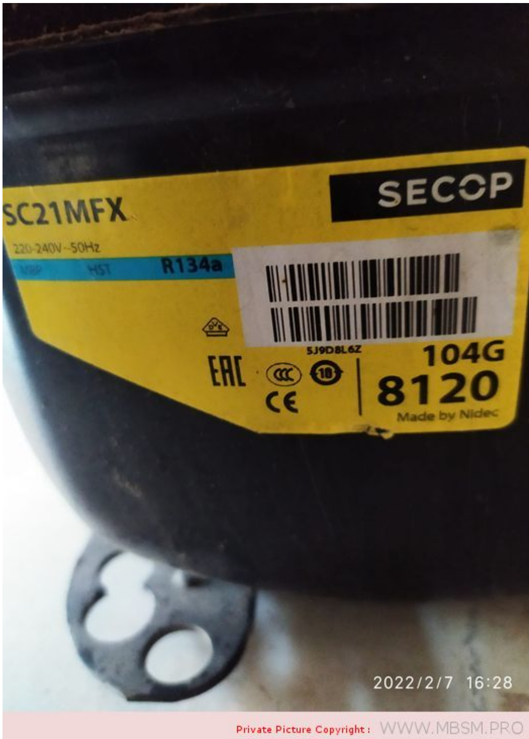
Mbsm.pro, Compressor, Danfoss, Secop, 5/8 hp++, SC21MFX, MBP, R134a, 220 V-240 V, 50 Hz, 104G8120, 8120