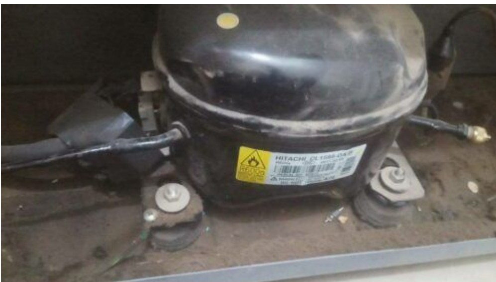
Private Picture Copyright : WWW.MBSM.PRO