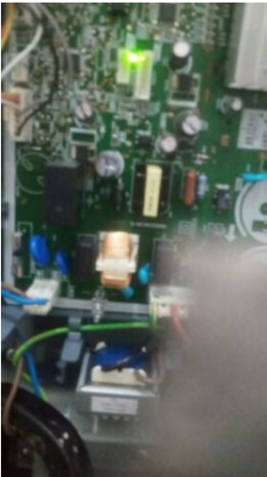
Private Picture Copyright : WWW.MBSM.PRO