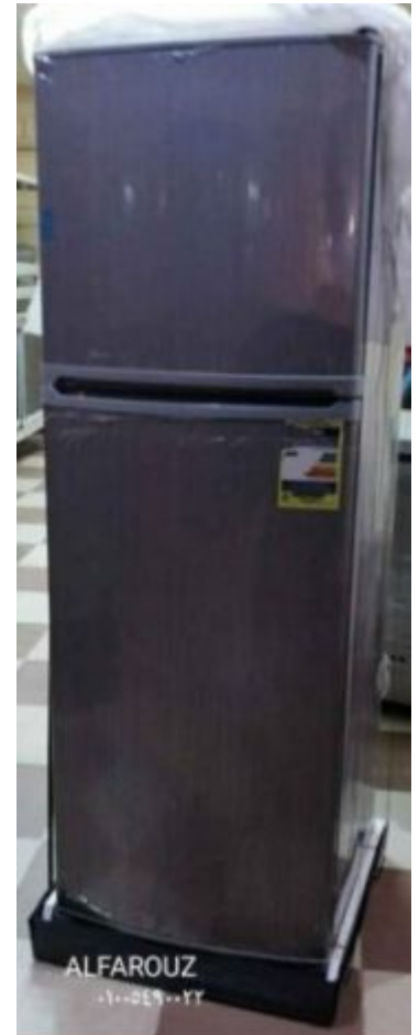
ht : WWW.MBSM.PRO