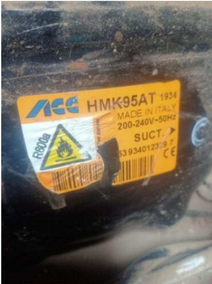
Private Picture Copyright : WWW.MBSM.PRO