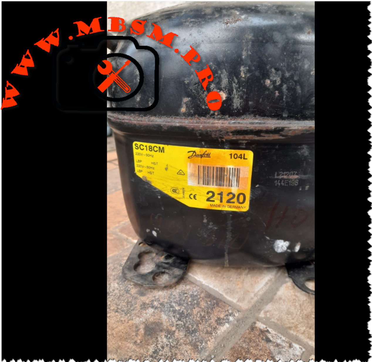
Mbsm.pro, 104L2120, DANFOSS, REFRIGERATION, Reciprocating, compressor, SC18CM, 3/4 hp, lbp, r22, 220v/50hz/1ph

Mbsm.pro, TOSHIBA, REFRIGERATOR, FREEZER, GR-EFV35, 12 feet, 3 D00R, 307 L, compressor, 1/5 hp, 140 w, lbp, r134a, 145 g