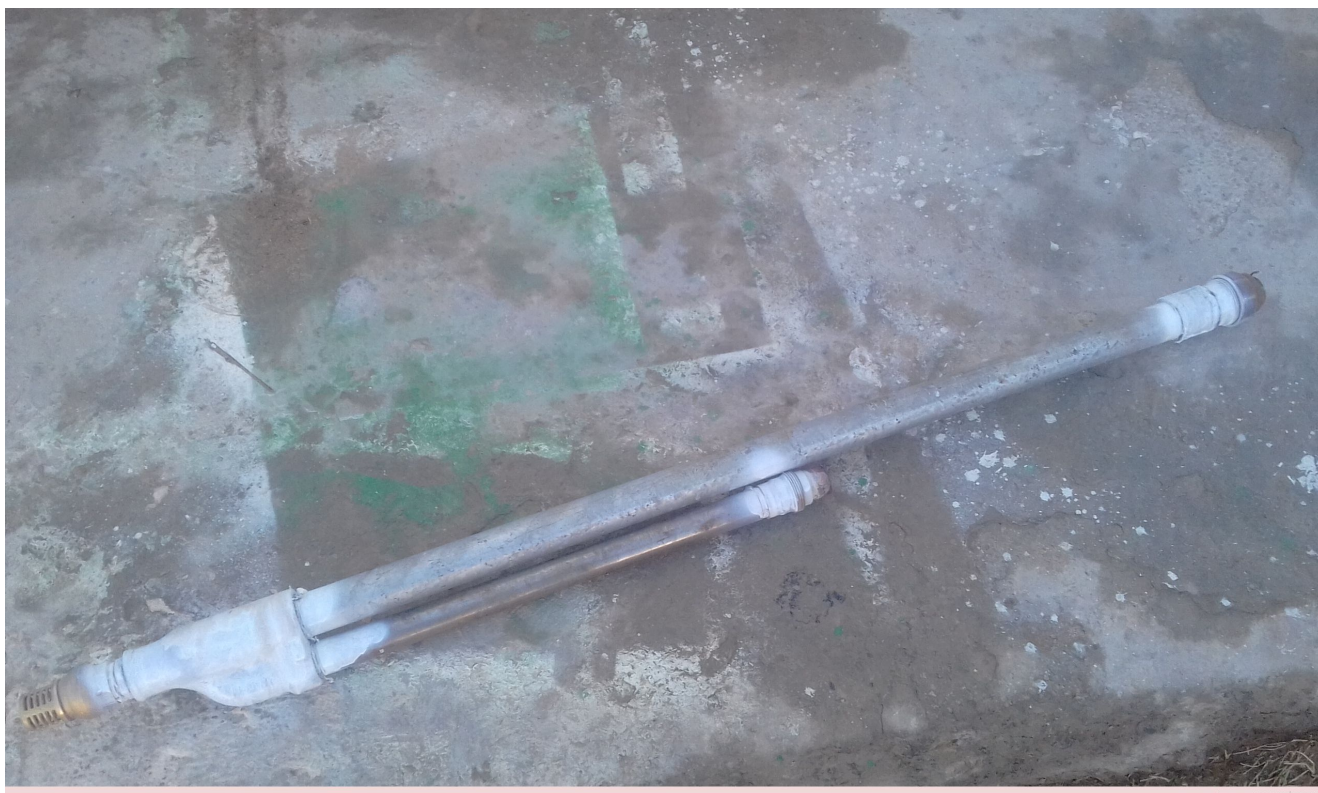
EJECTEUR-DAB-mbsm-dot-pro (2).jpg (465 KB)