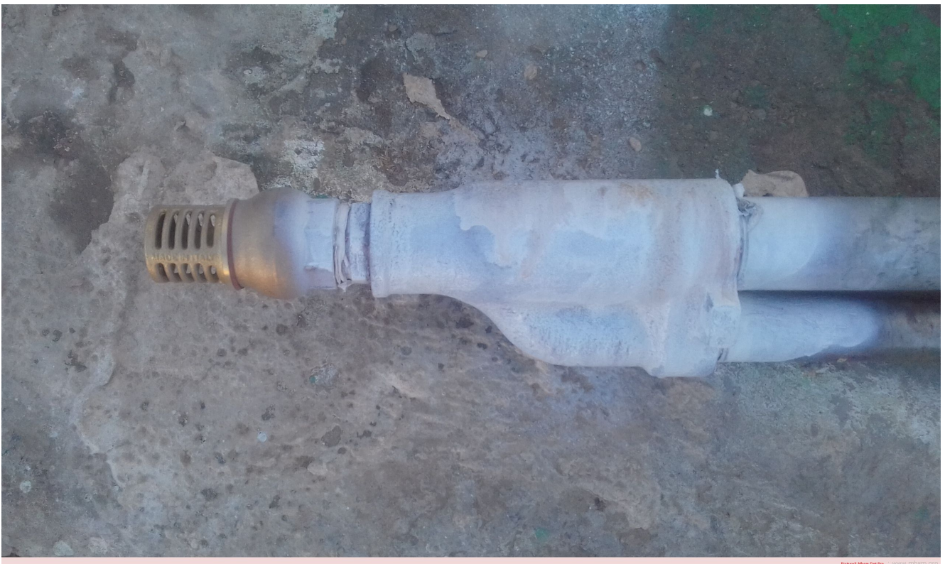
EJECTEUR-DAB-mbsm-dot-pro (3).jpg (467 KB)