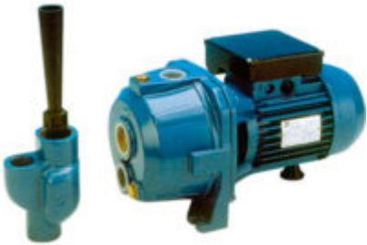
EJECTEUR-DAB-mbsm-dot-pro (8).jpg (8 KB)