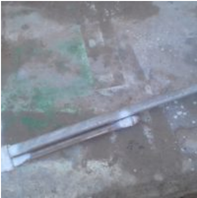
EJECTEUR-DAB-mbsm-dot-pro (3).jpg (1 MB)