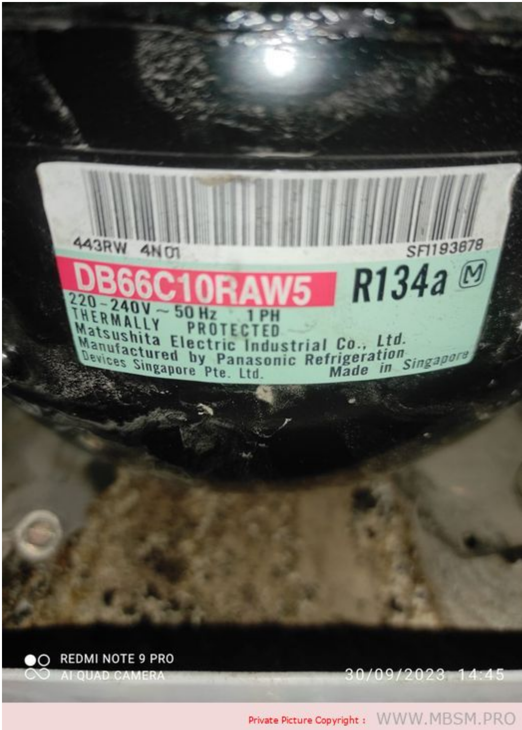
Mbsm.pro, Panasonic, Compressor, DB66C10RAW5, RSCR, 1/5 hp, Lbp