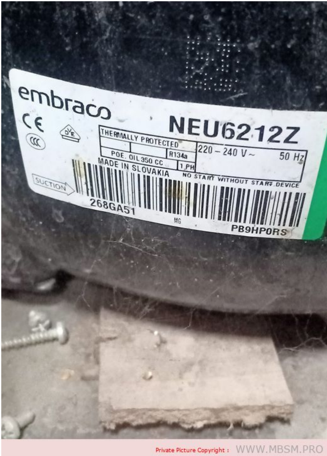
Mbsm.pro, Compressor, NEU6212Z, 1/2 hp, EMBRACO, ASPERA, R134A, hbp