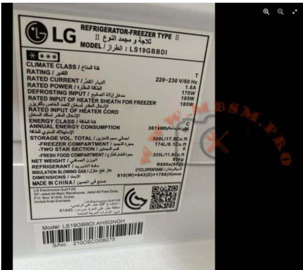
Private Picture Copyright : WWW.MBSM.PRO