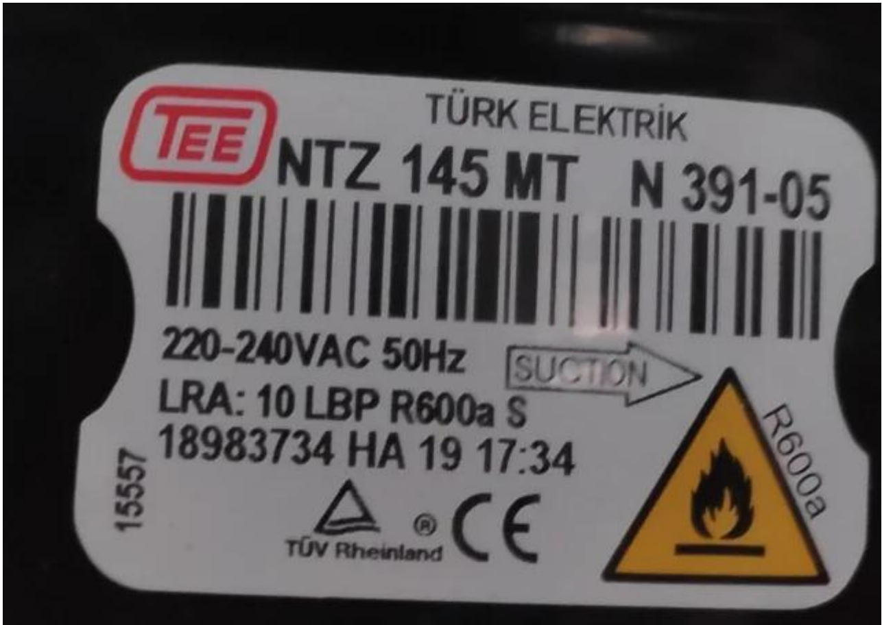
Mbsm.pro, Compressor, Tee Compressor, NTZ145MT, 1/5 hp, 168 W, Lbp, 145 kcal