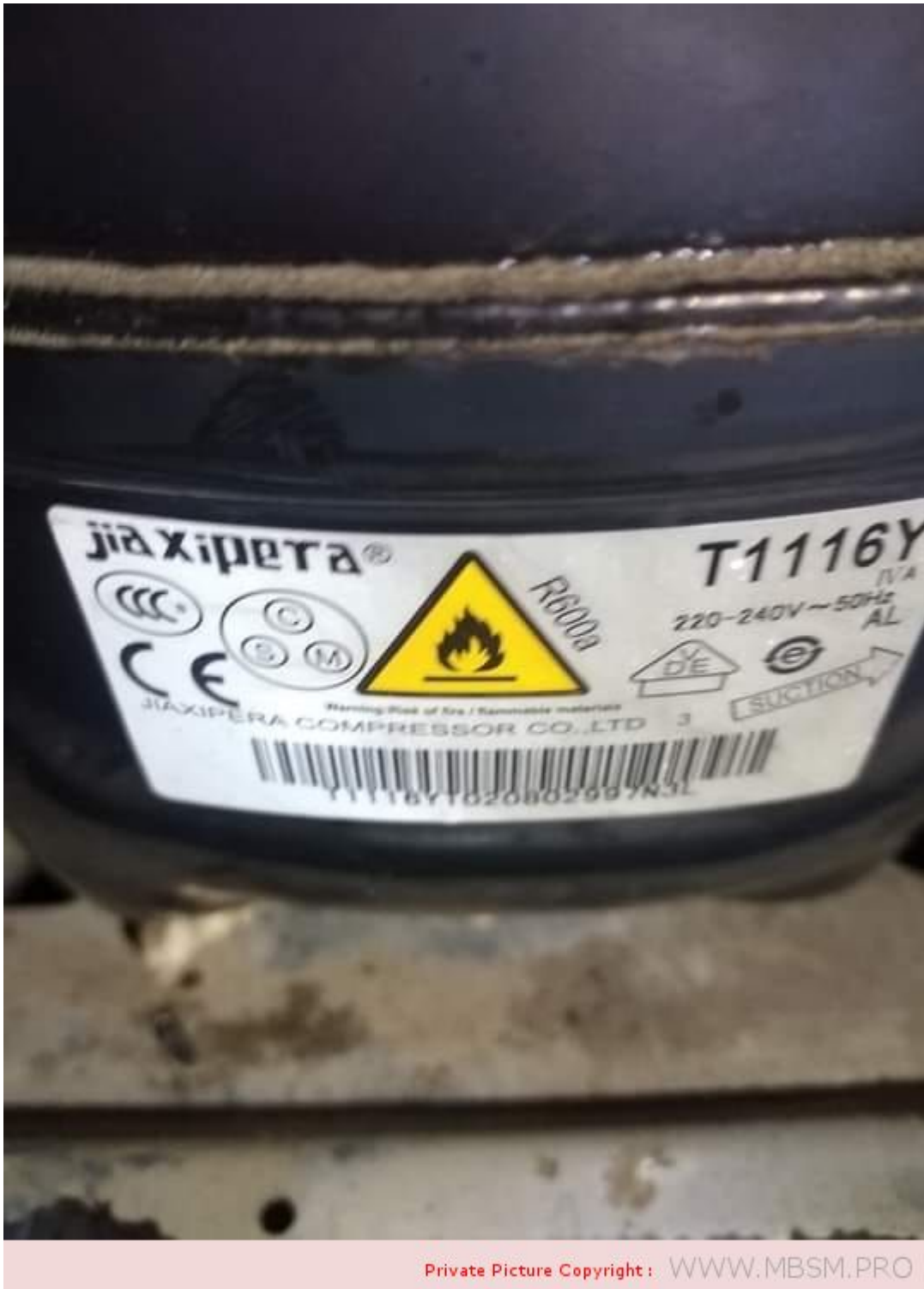
Mbsm.pro, mini fridge, Compressor, JIAXIPERA, T1116Y, 1/5 Hp, LBP, R600a, 220-240V, 10.5 cm 3 ., 184 W, 628 BTU/u