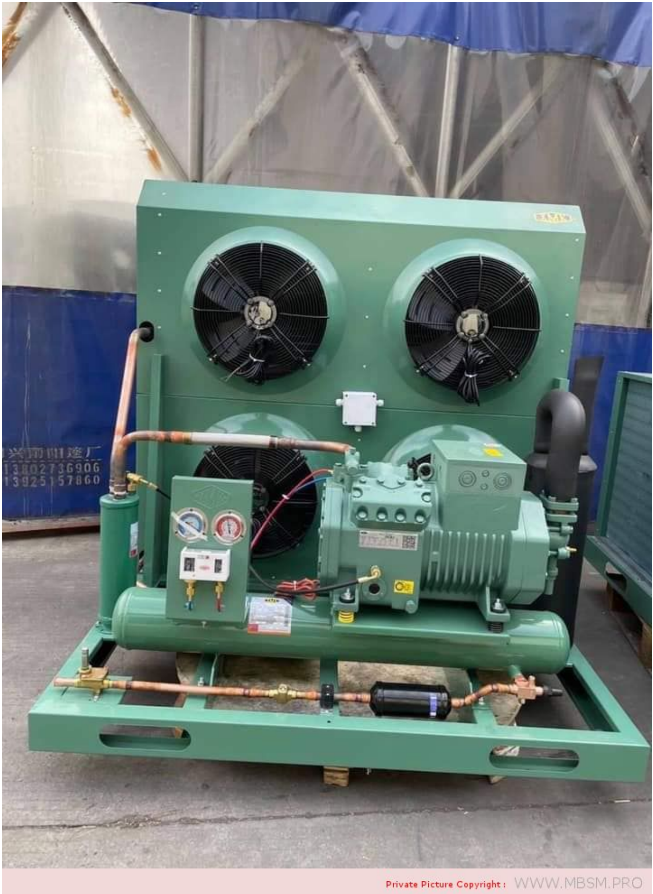
Mbsm.pro, BITZER, Semi Hermetic, 4VES-7, R22, 7.0 Hp, 14.0 A, 32,939 btu