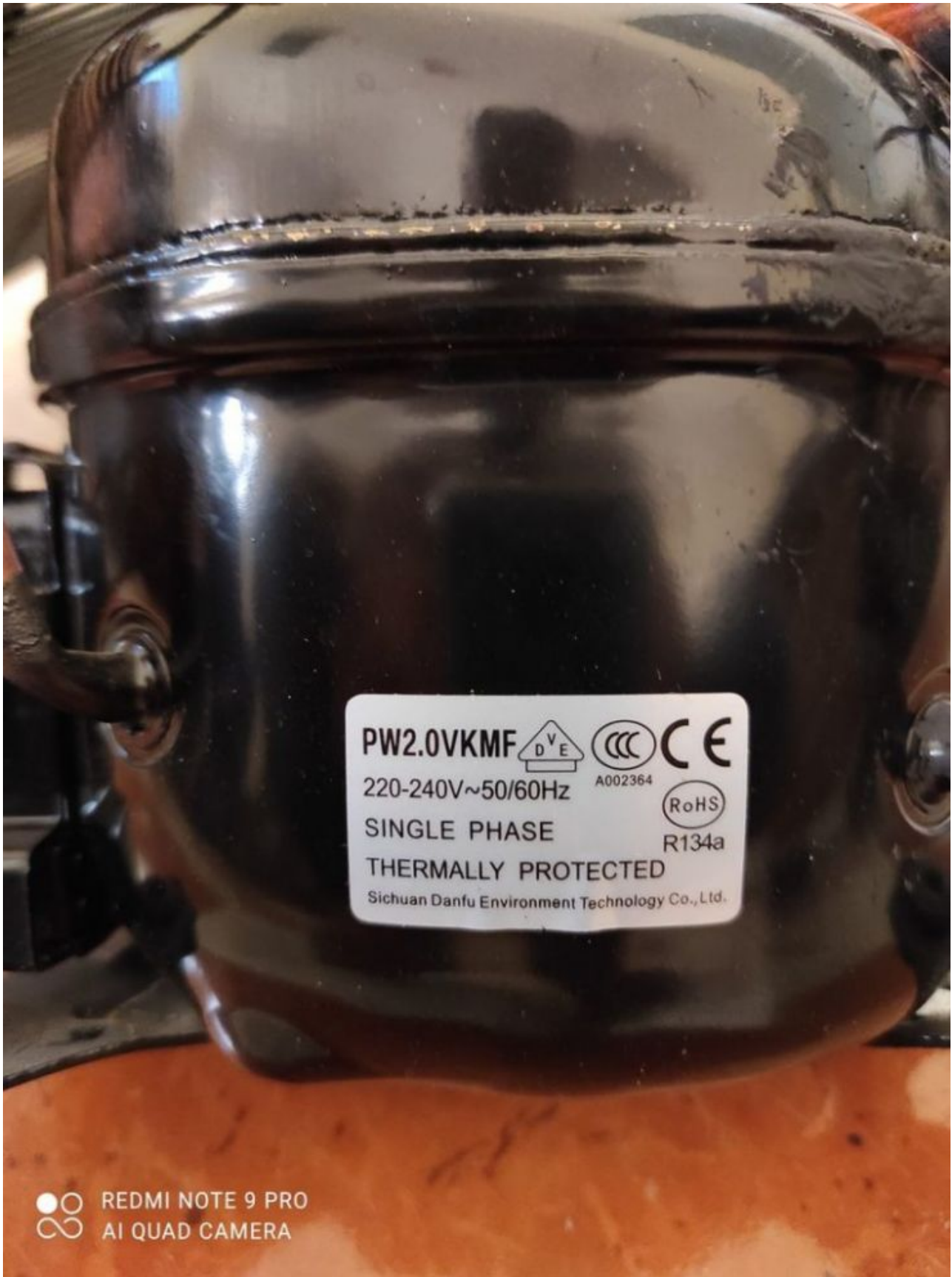
R134A, LBP, Motor, Danfu, Compressor , PW2.0VK, 1/15hp