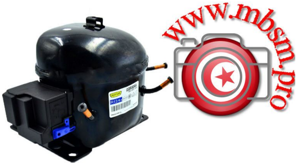
KONOR Compressor GQR80AA