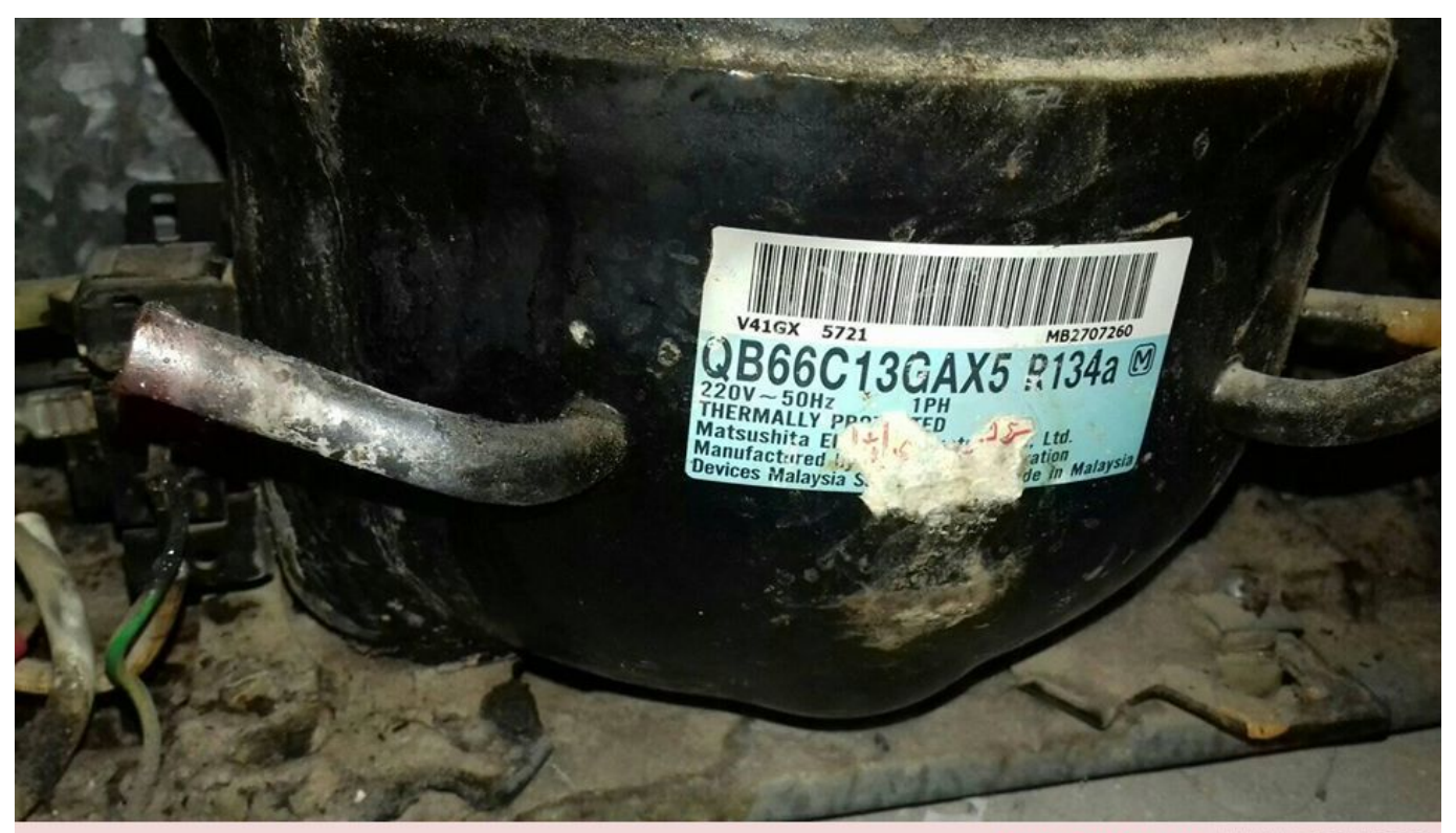
Private Picture