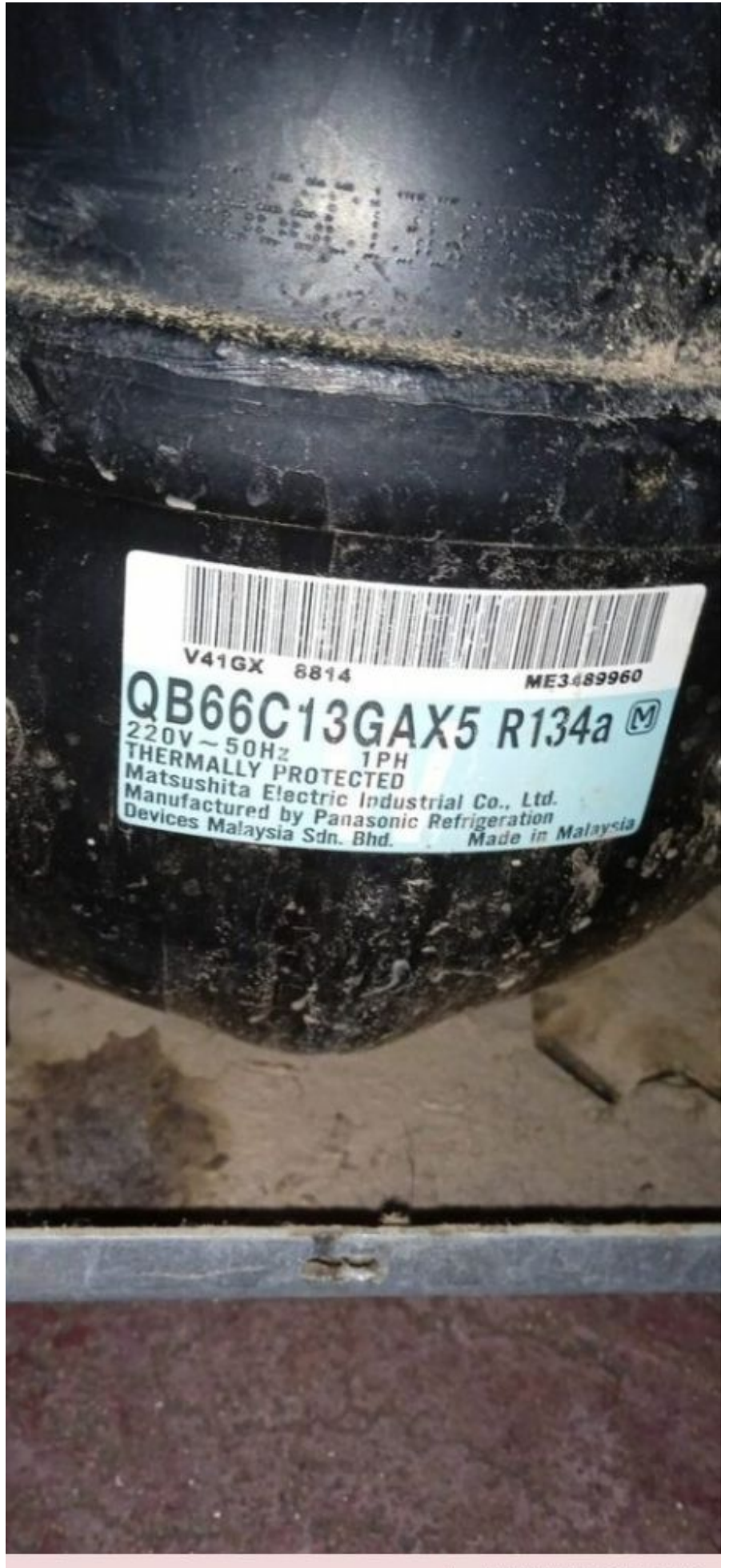
Private Picture Copyright: WWW.MBSM.PRO