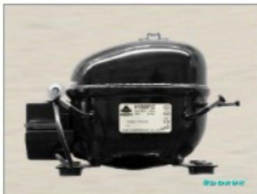
HY 81 Y