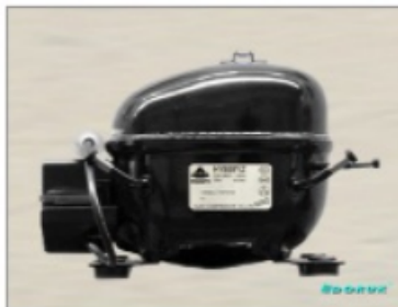
HYE 60 YL 63