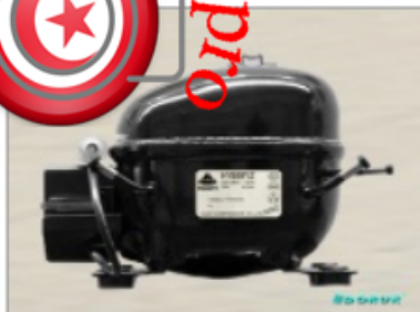
AE 1370 Y