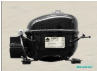
AE 1330 Y