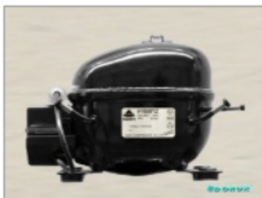
HYE 125 MSU