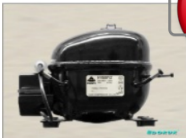
AE 1360 Y