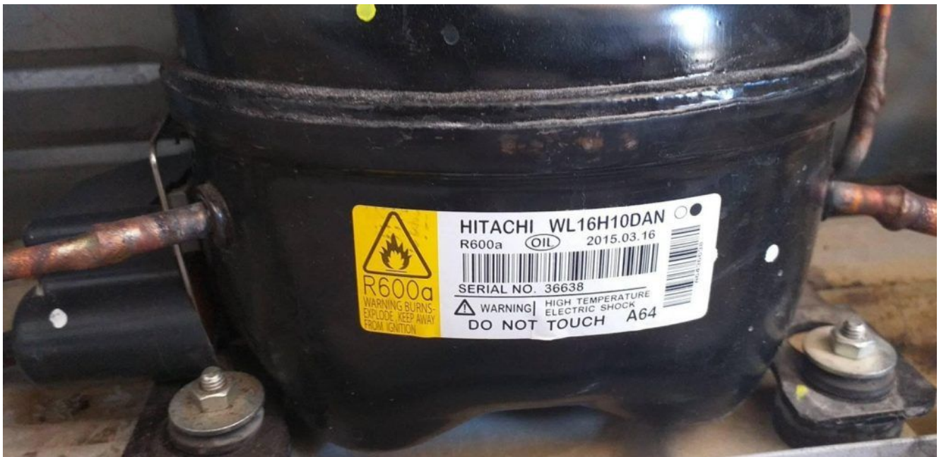
Private Picture Copyright: WWW.MBSM.PRO