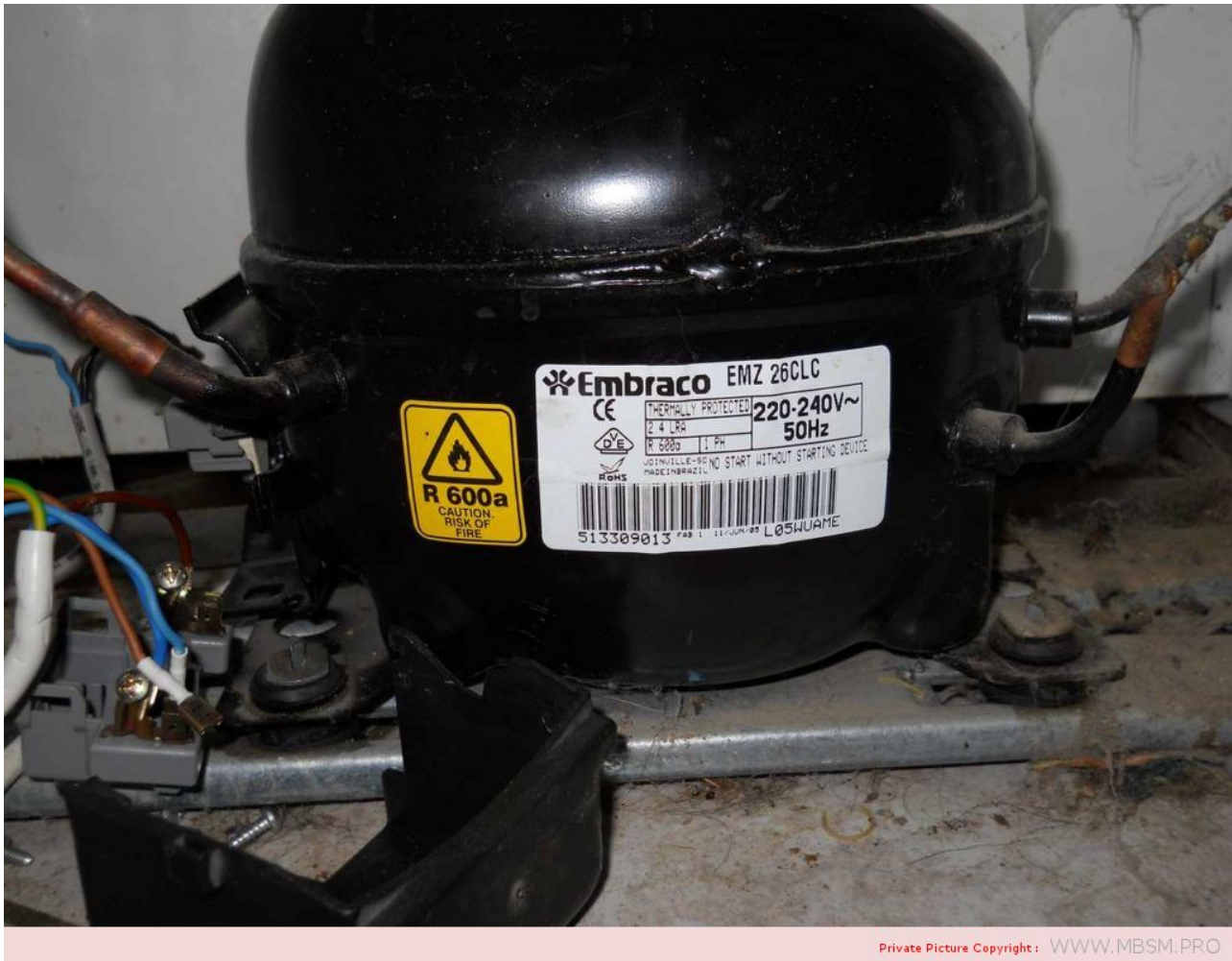
Compressor, Embraco, Aspera, EMY26CLC, LBP, R600a, 220 – 240V/1/50Hz, 1/12 HP, RSIR, LRA 7.8 A, 83 Wat