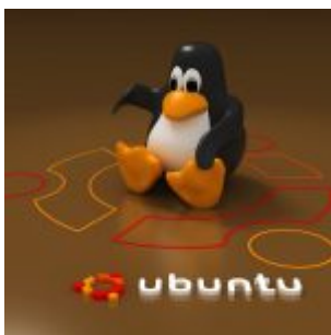
mbsm_dot_pro_ubuntu1.jpg (65 KB)