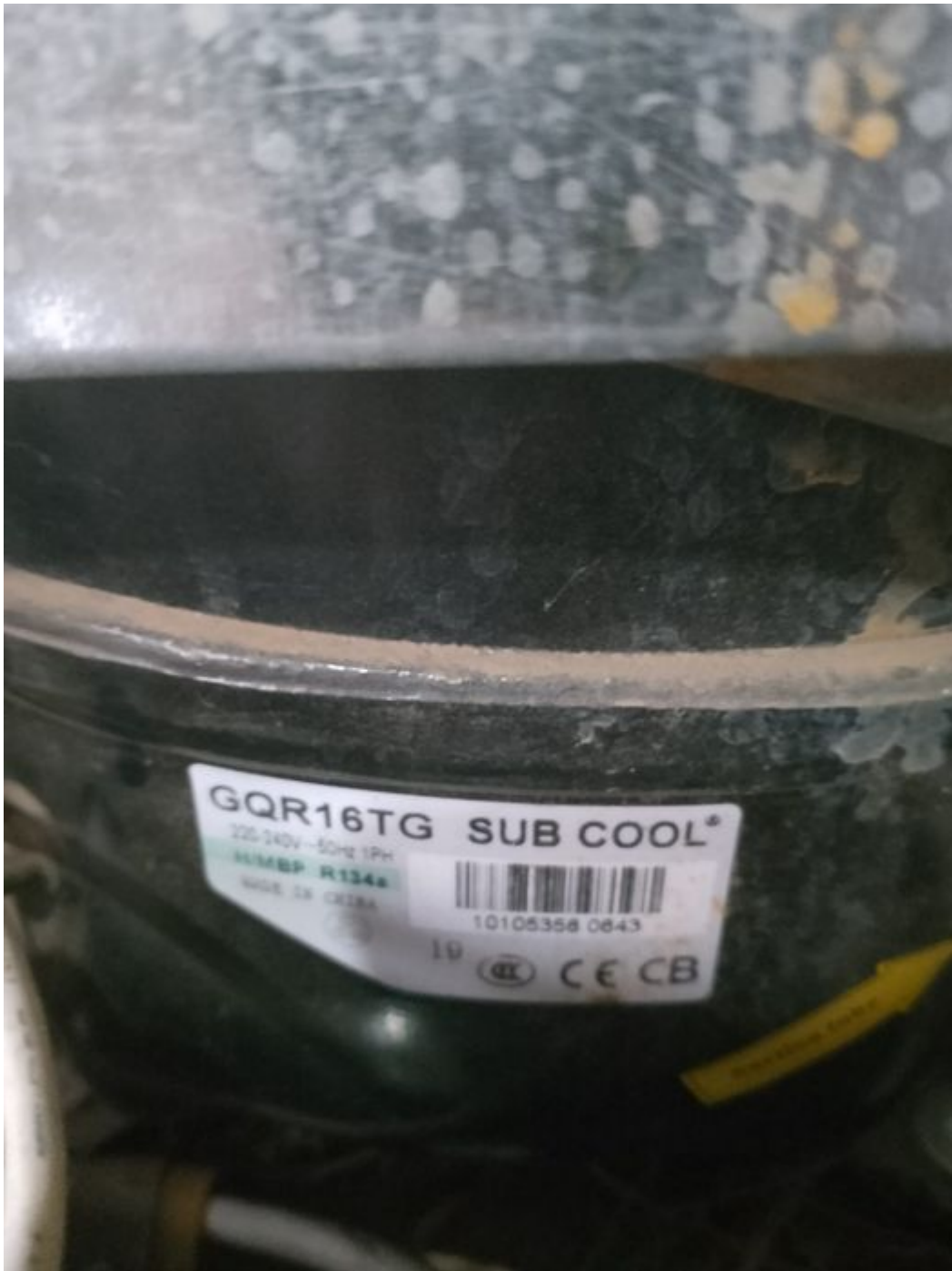
GQR16TG, light, commercial, refrigeration, compressor ,1 / 2+ HP, 220V/50Hz, CSIR, capacitor:80UF, R134A