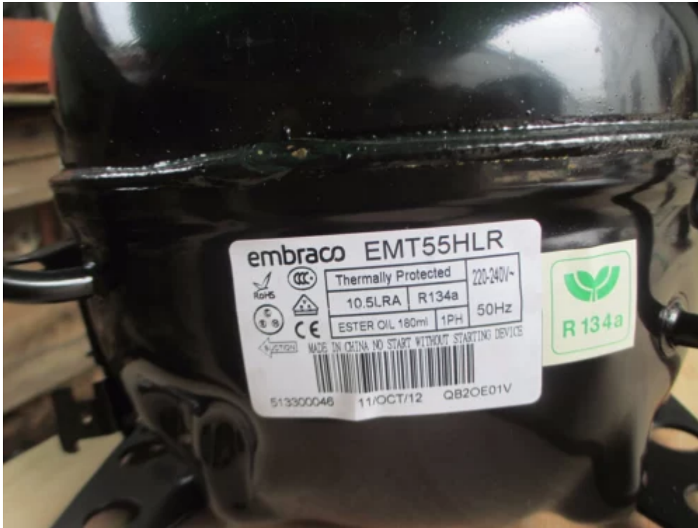
1 / 6HP R134a compresseur de réfrigérateur marque EMT45HLR Embraco