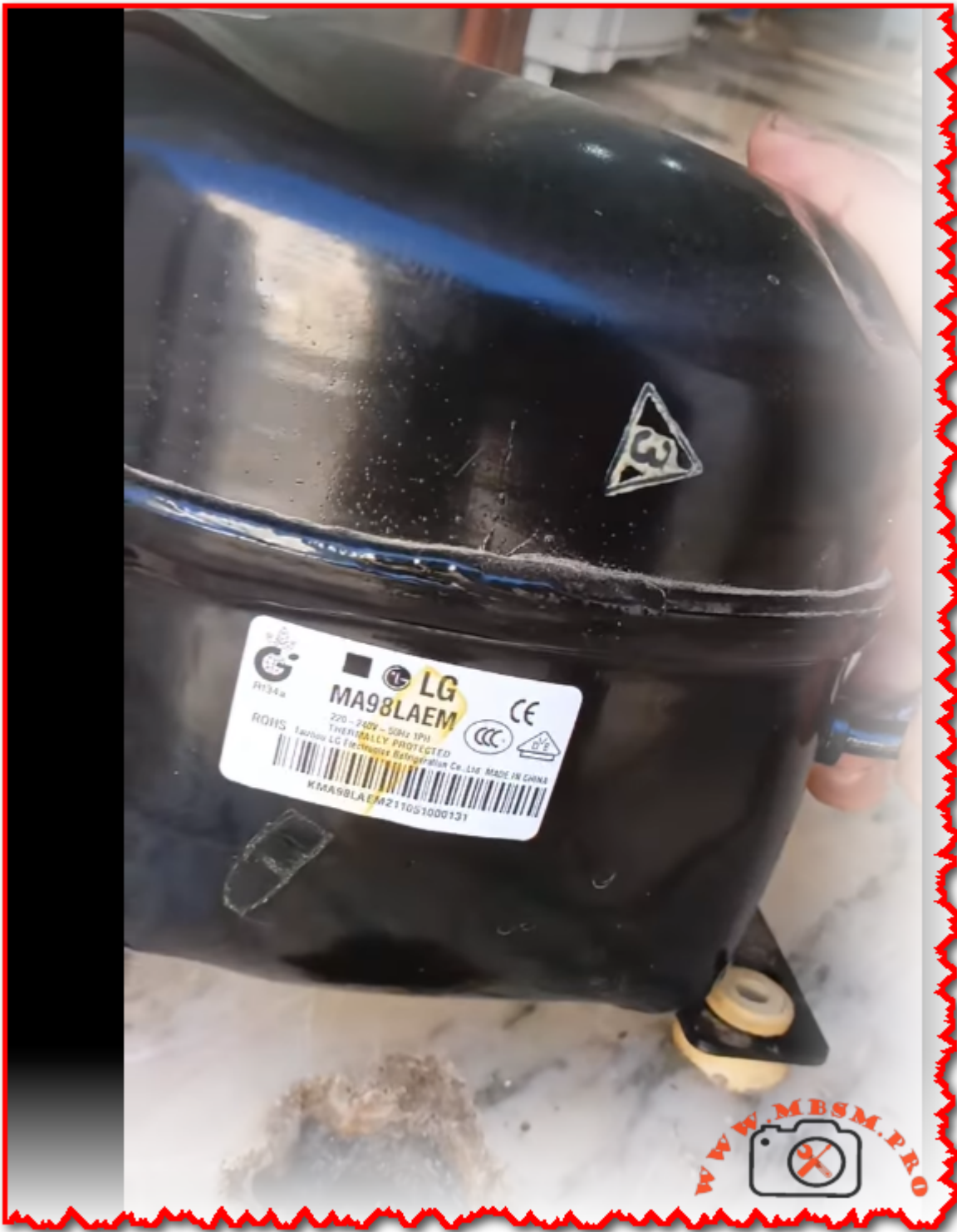
KK R134a and R404a Commercial Refrigeration Compressors