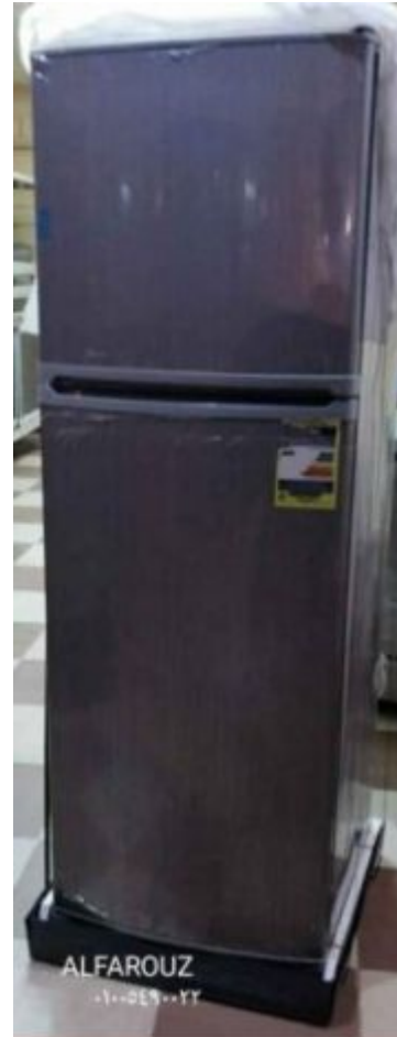
ht : WWW.MBSM.PRO