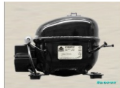
AE 1350 Y 1 / 6 HP