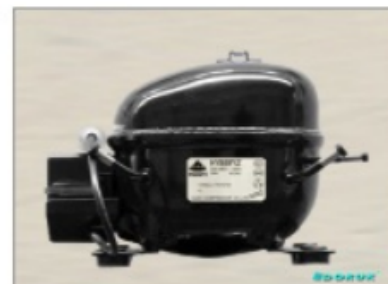
AE 1390 Y 1 / 4 HP