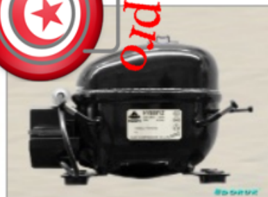
AE 1370 Y 1 / 4 HP