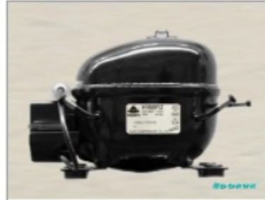
HYE 60 YL 63