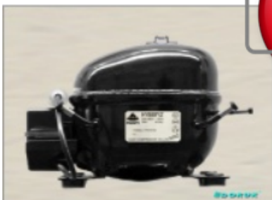
AE 1360 Y 1 / 5 HP