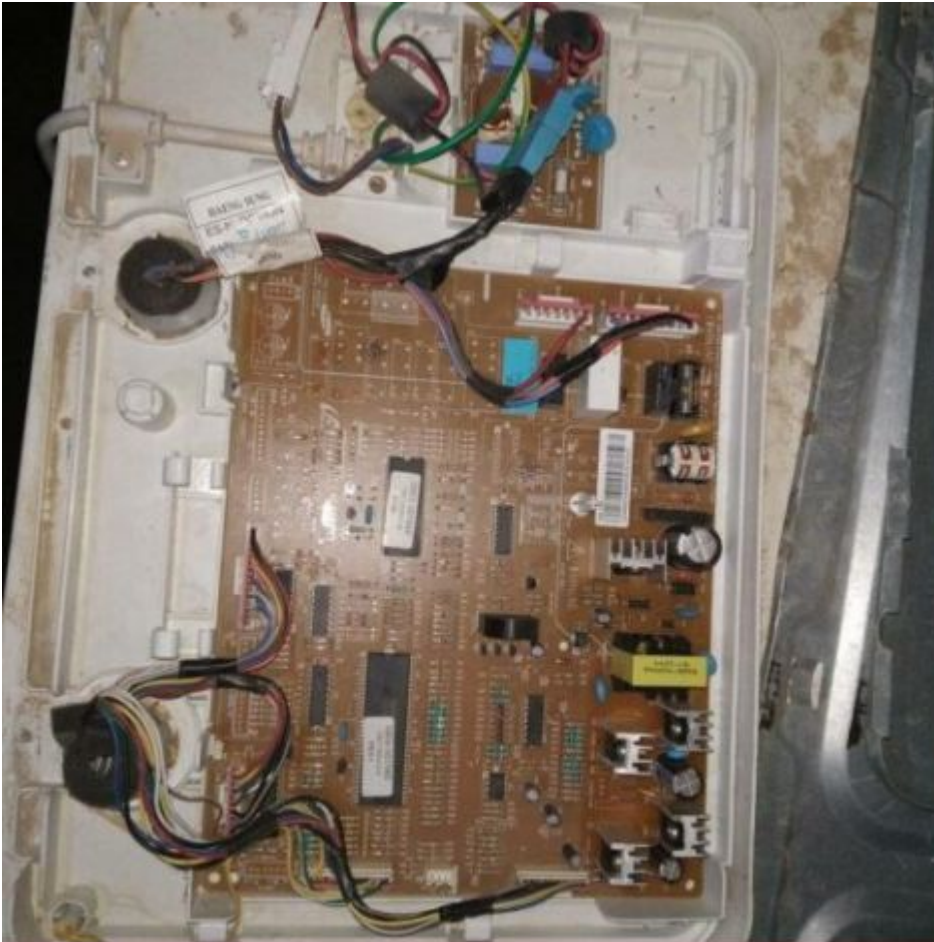
Private Picture Copyright : WWW.MBSM.PRO