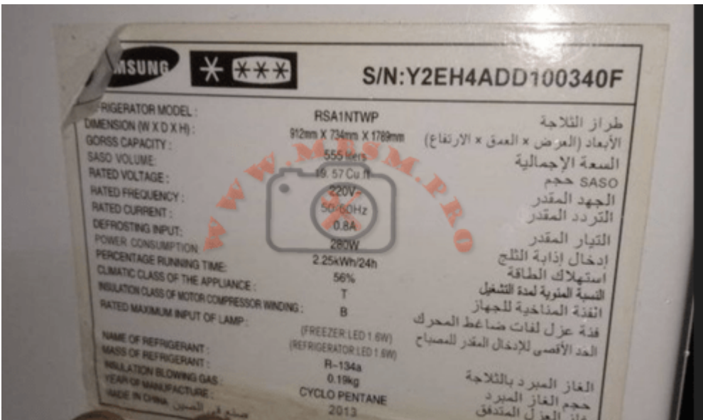
Private Picture Copyright : WWW.MBSM.PRO