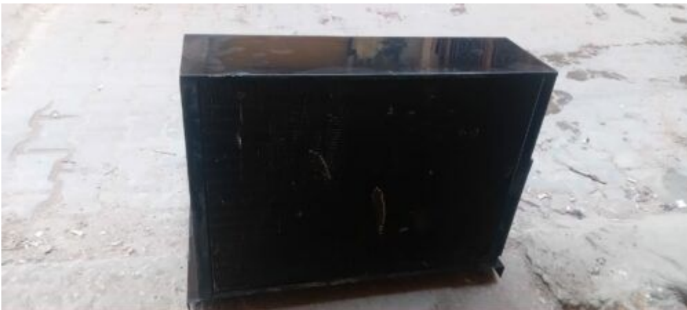
Private Picture Copyright : WWW.MBSM.PRO