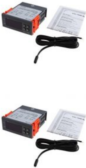
mbsmdotpro-regulateur (1).png (527 KB)