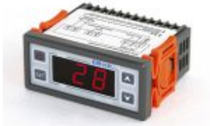
mbsmdotpro-regulateur (3).jpg (32 KB)