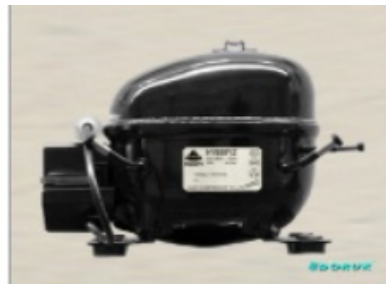
AE 1340 Y 1 / 6 HP