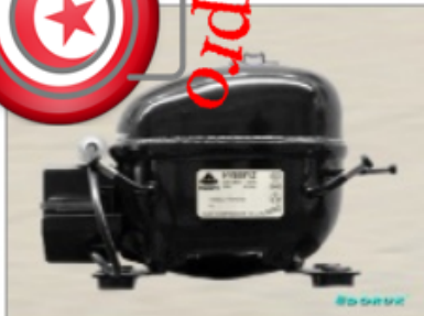
AE 1370 Y