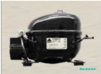
AE 1330 Y