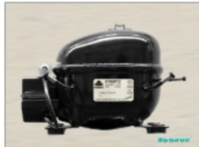
AE 1390 Y