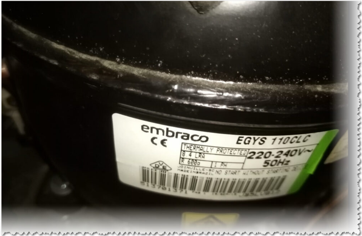
Mbsm.pro, Compressor, Embraco, EGYS110CLC, 1/3 hp, lbp, r600a, 263 w, 1.1a