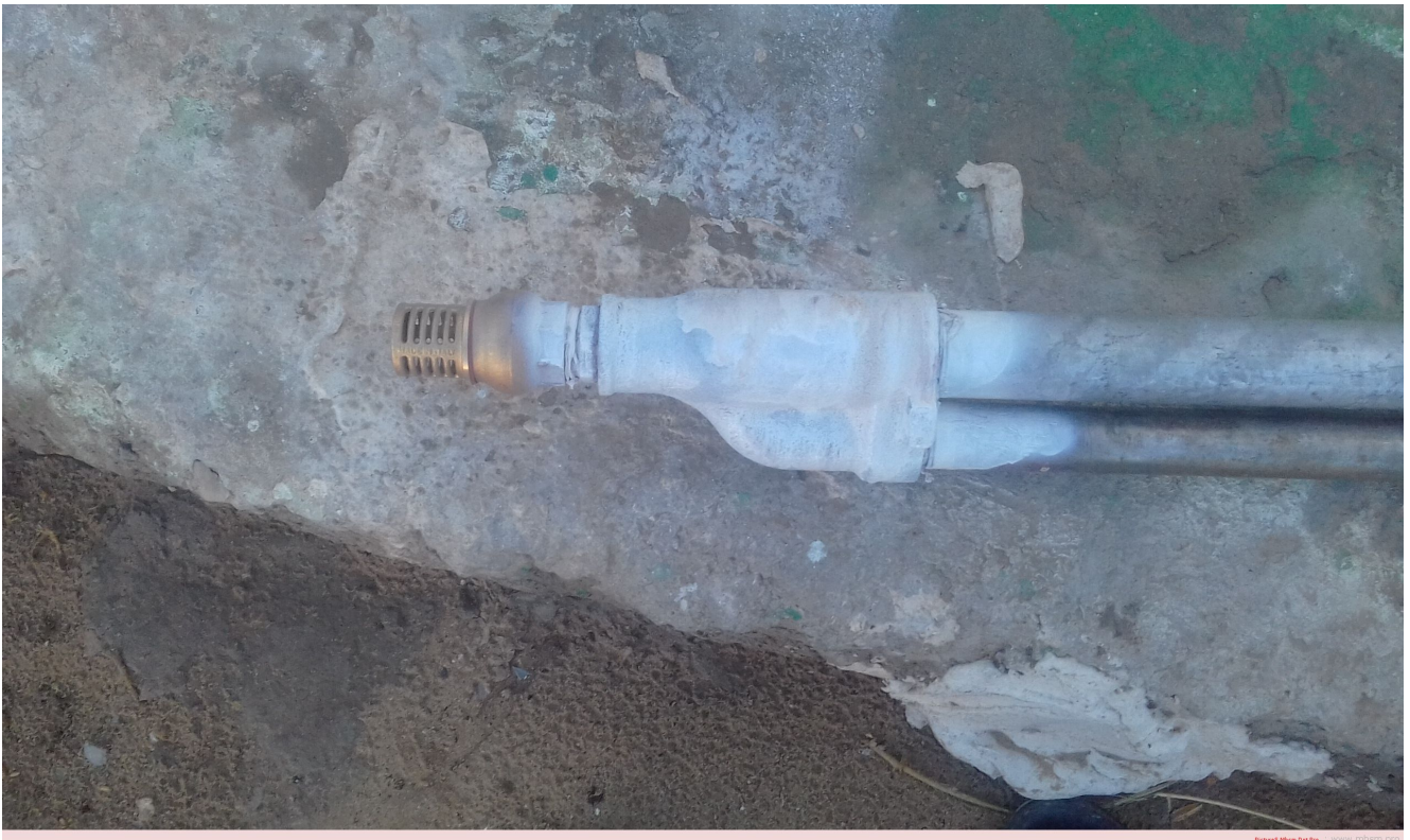
EJECTEUR-DAB-mbsm-dot-pro (5).jpg (524 KB)