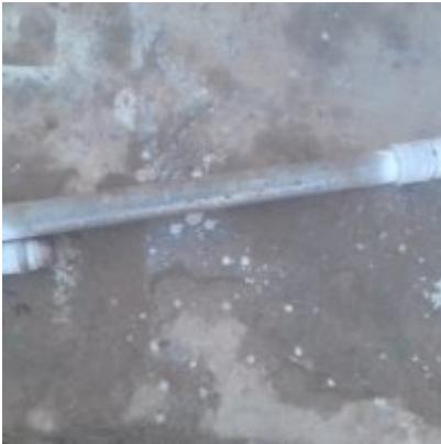
EJECTEUR-DAB-mbsm-dot-pro (5).jpg (1 MB)