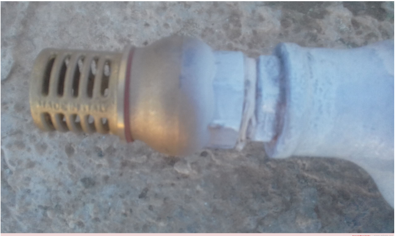
EJECTEUR-DAB-mbsm-dot-pro (6).jpg (318 KB)