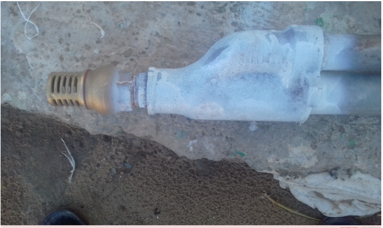
EJECTEUR-DAB-mbsm-dot-pro (7).jpg (451 KB)