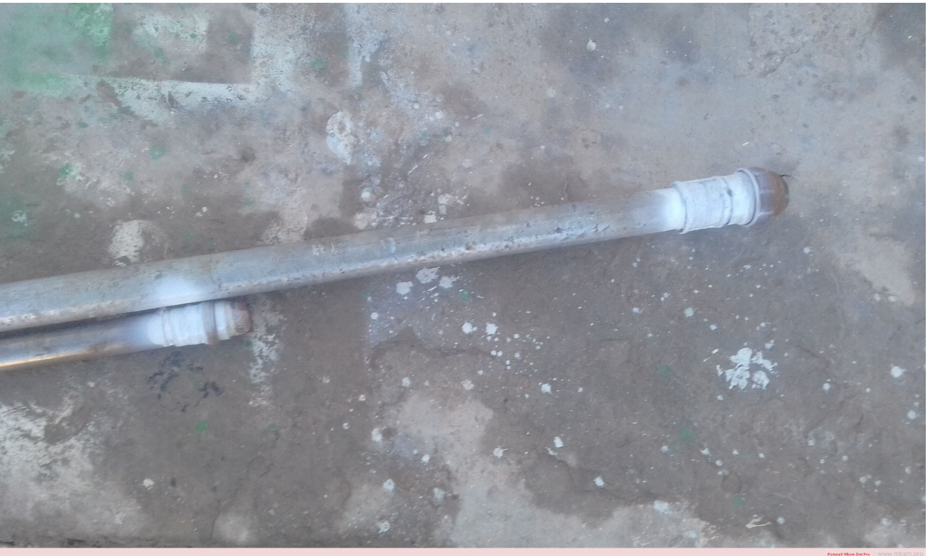
EJECTEUR-DAB-mbsm-dot-pro (4).jpg (408 KB)