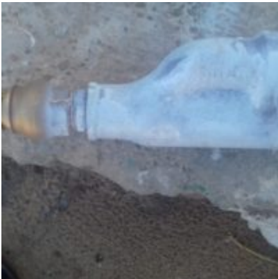
EJECTEUR-DAB-mbsm-dot-pro (7).jpg (451 KB)