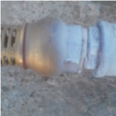
EJECTEUR-DAB-mbsm-dot-pro (7).jpg (1 MB)