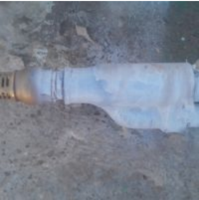
EJECTEUR-DAB-mbsm-dot-pro (4).jpg (1 MB)