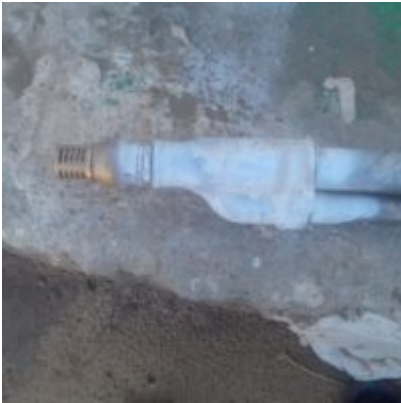
EJECTEUR-DAB-mbsm-dot-pro (6).jpg (1 MB)