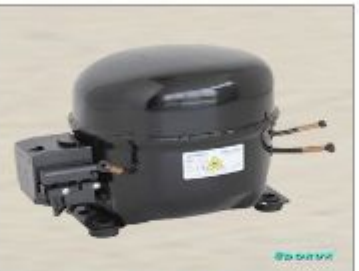
ND 1110 Y 1 / 7 HP