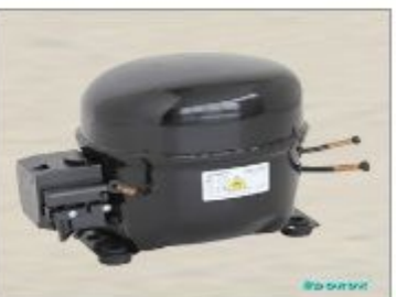
NX 1090 Y 1 / 8 + HP