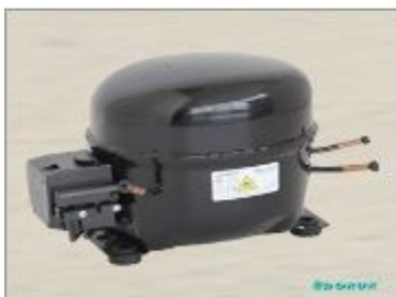
ND 1112 Y 1 / 6 + HP