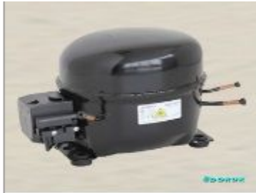
ZBX 1122 CY 1 / 4 + HP