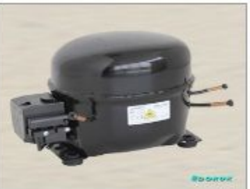
ND 1111 Y 1 / 6 - HP