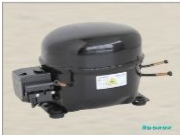
ND 1090 Y 1 / 8 + HP