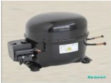
ZBX 1119 CY 1 / 4 + HP