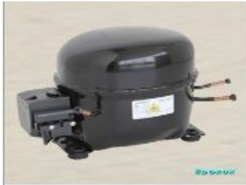
ZBX 1121 CY 1 / 4 + HP