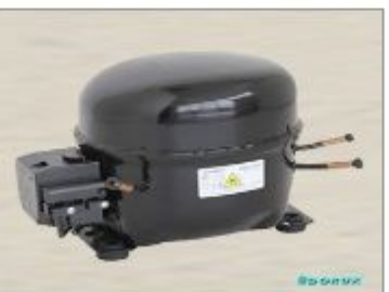
NX 1080 Y 1 / 8 HP