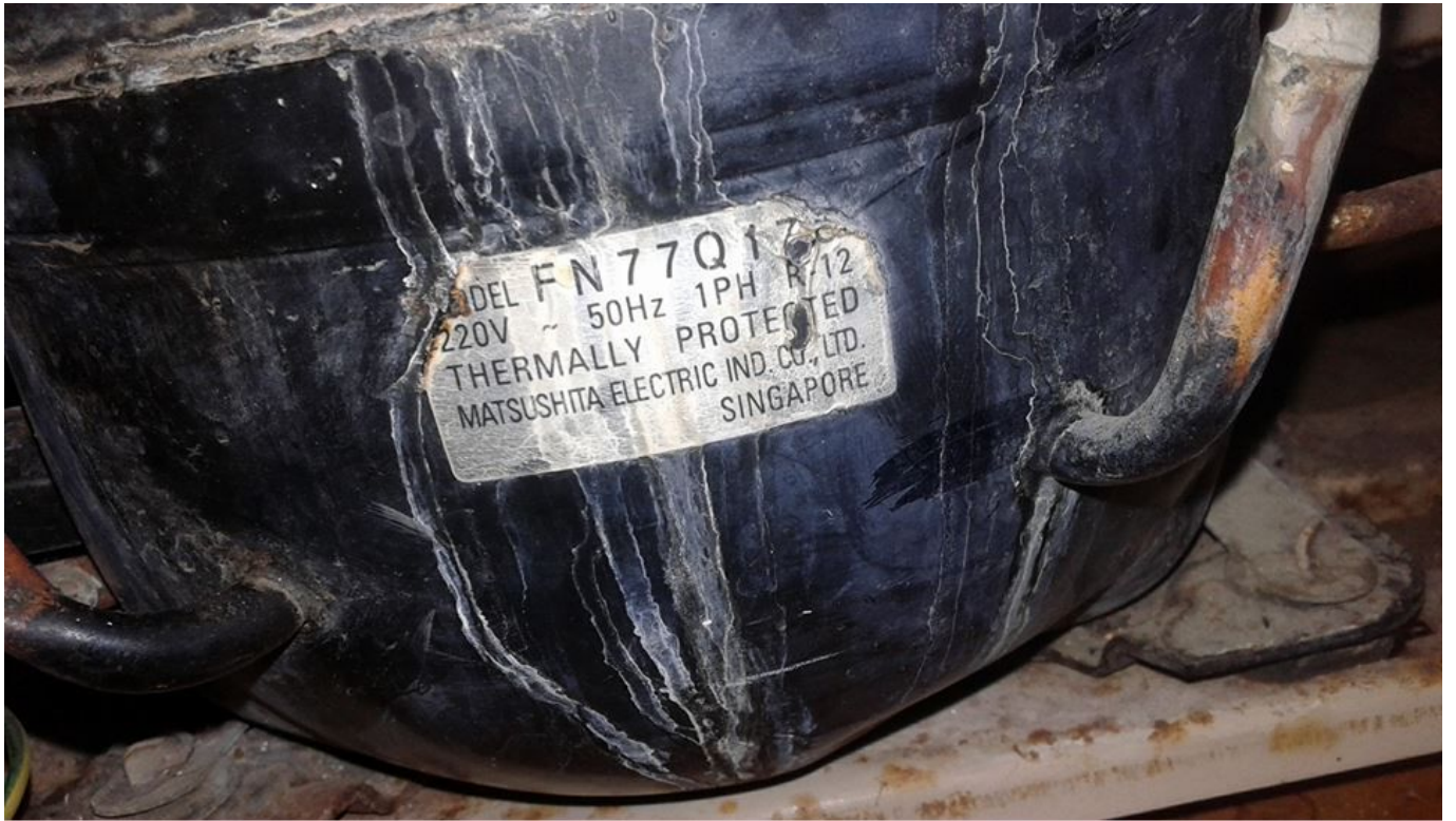
Picture5 Mbsm Dot Pro : www.mbsm.pro