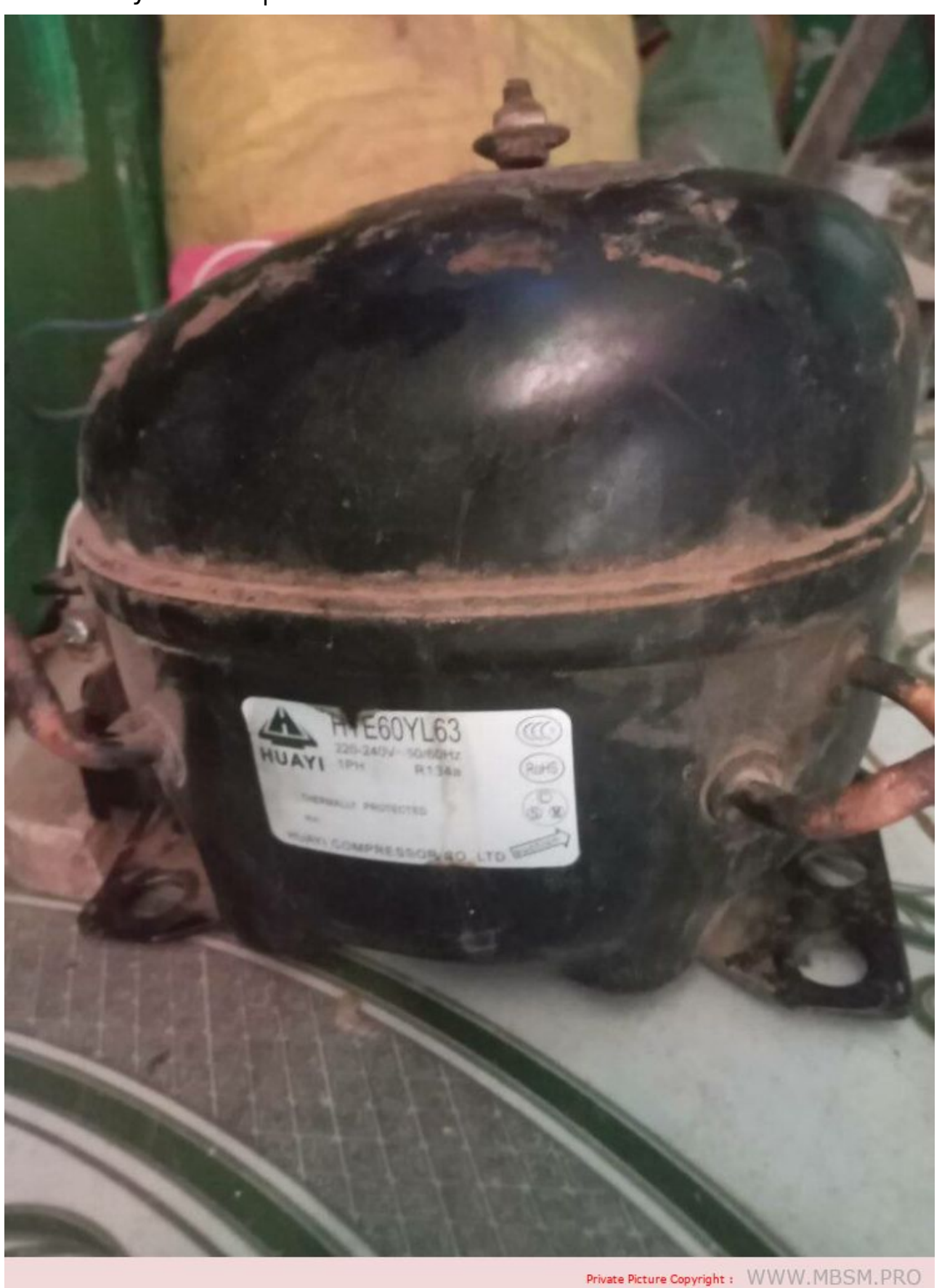
written by Amina | 6 November 2023