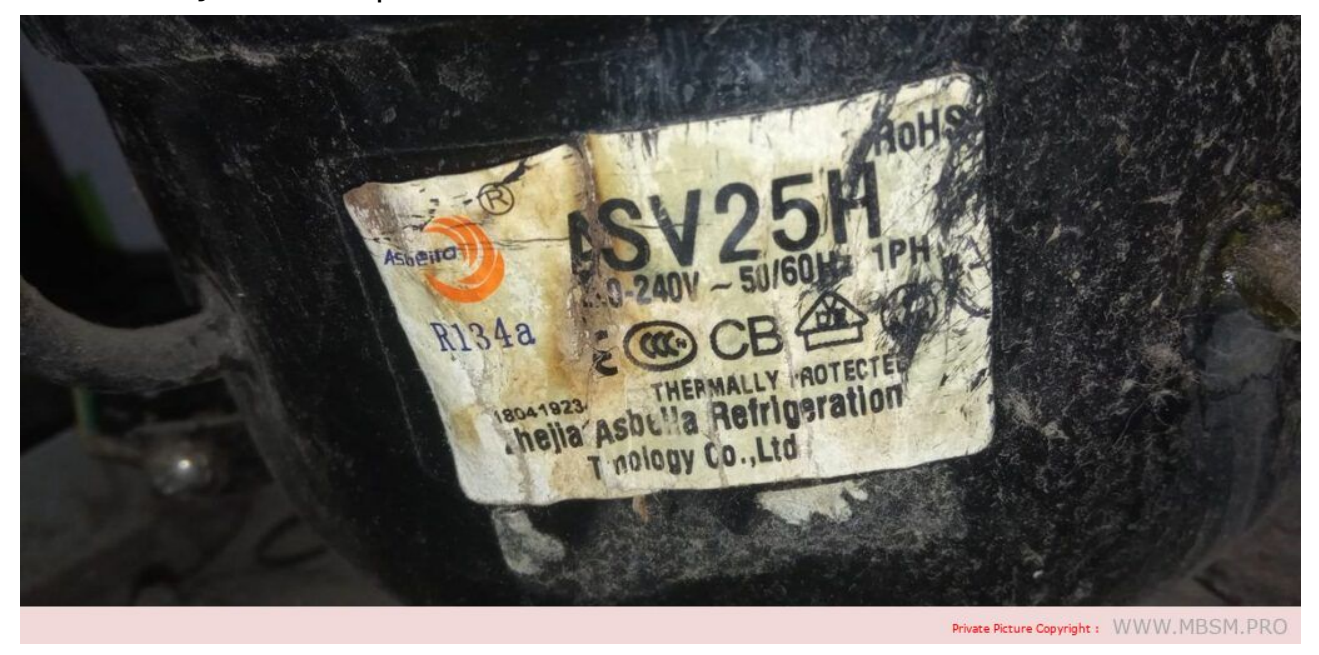
Water, dispenser, compressor, ASV25H, 1/13 hp, r134a, lbp

Huayi, HYE60YL63, Compressor, 1/5 hp, r134a, 146 kcal, full