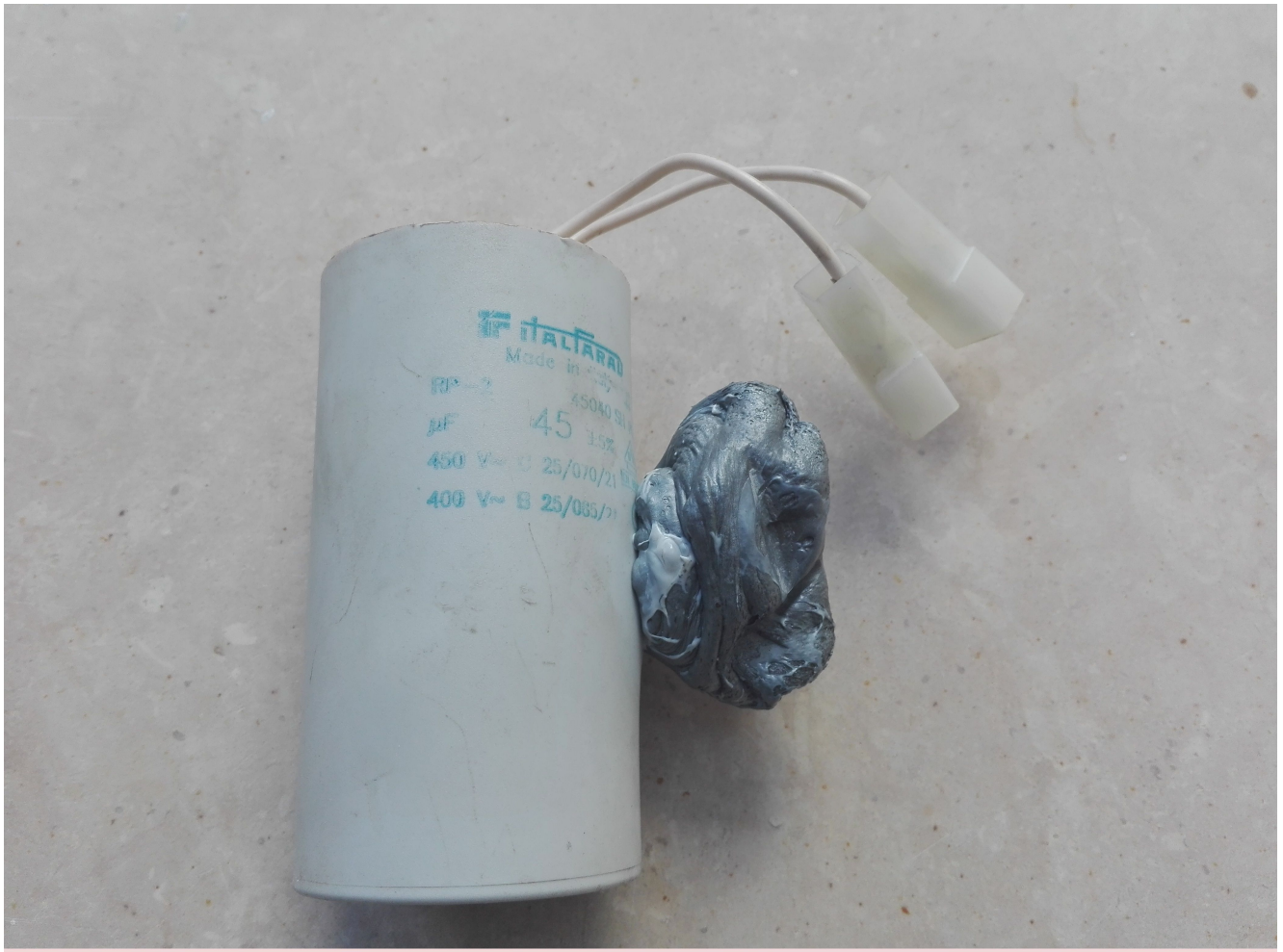
mbsm-dot-pro-capacitor-explodes- Pictures-G.jpg (856 KB)