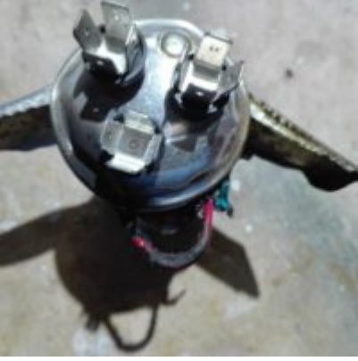
mbsm-dot-pro-capacitor-explodes- Pictures-D.jpg (3 MB)