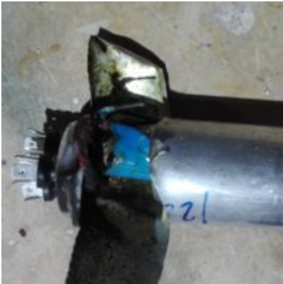
mbsm-dot-pro-capacitor-explodes- Pictures-C.jpg (3 MB)