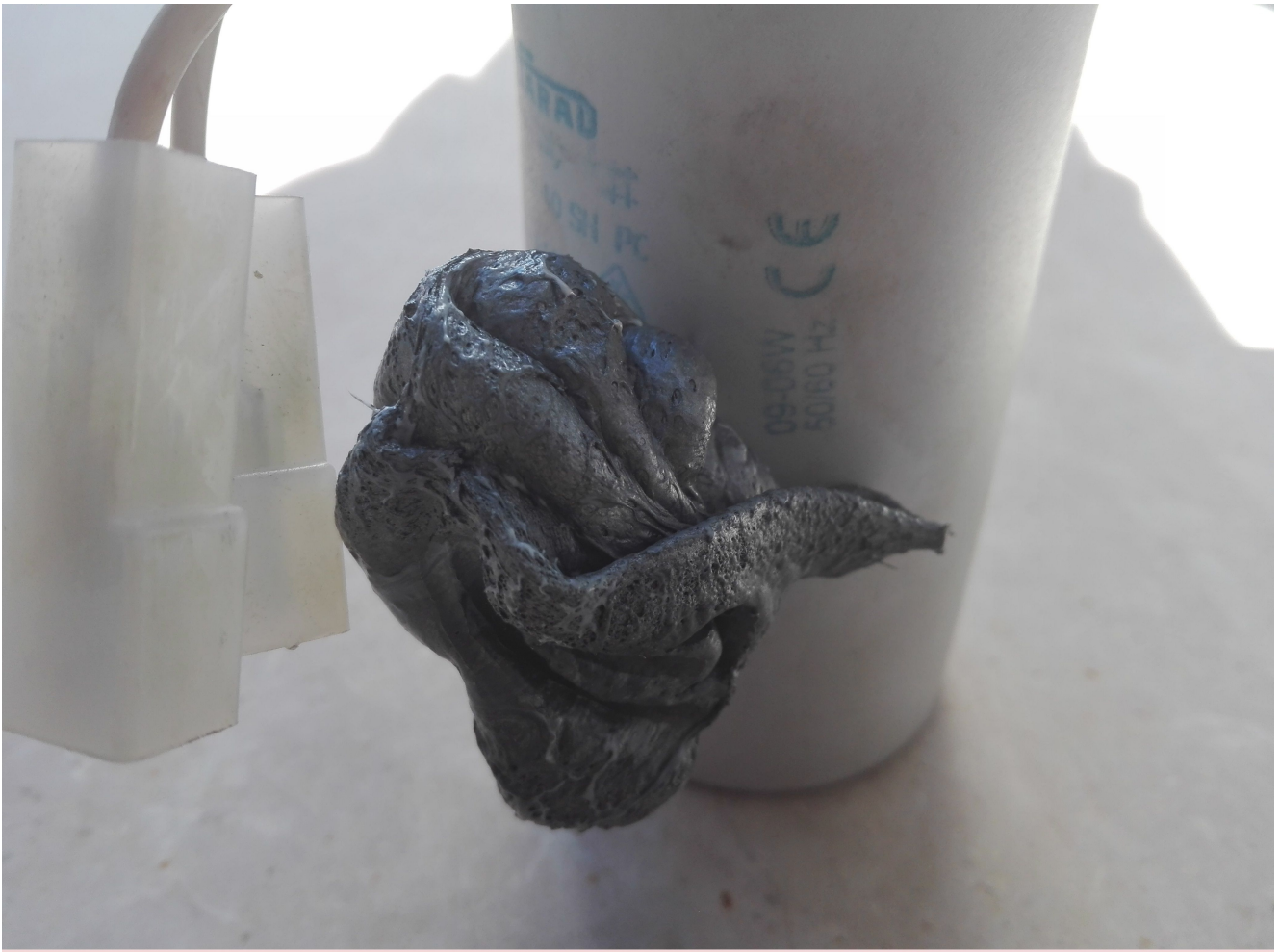
mbsm-dot-pro-capacitor-explodes- Pictures-H.jpg (690 KB)