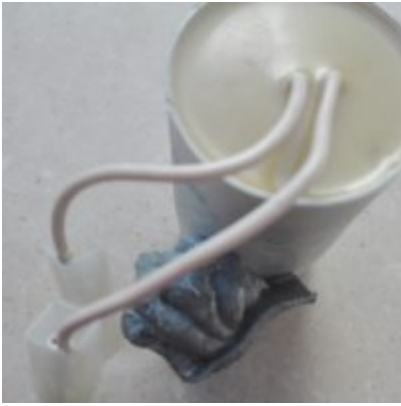
mbsm-dot-pro-capacitor-explodes- Pictures-J.jpg (2 MB)