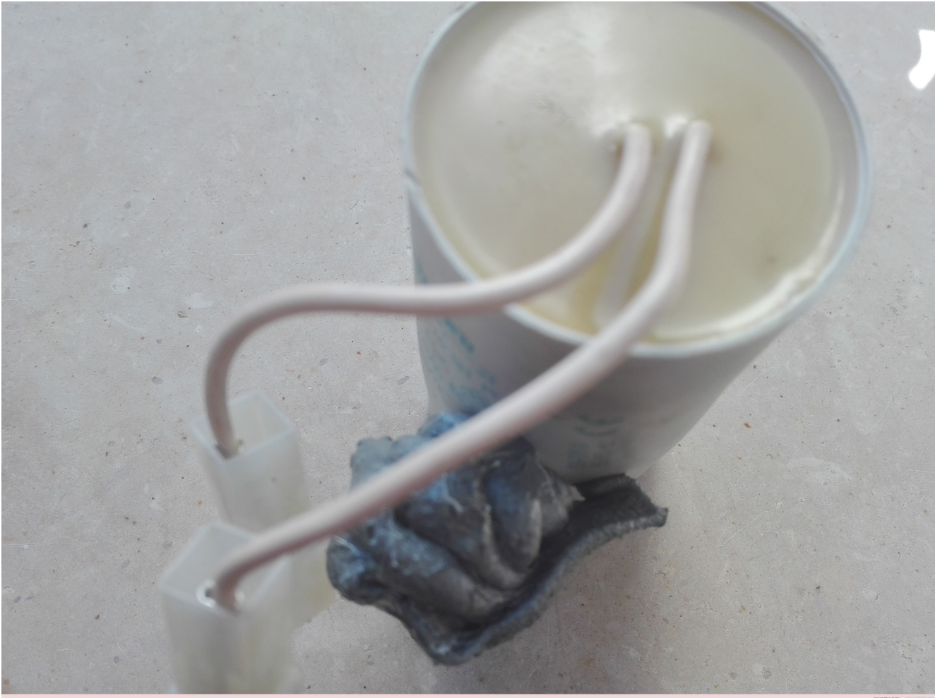
mbsm-dot-pro-capacitor-explodes- Pictures-I.jpg (1 MB)