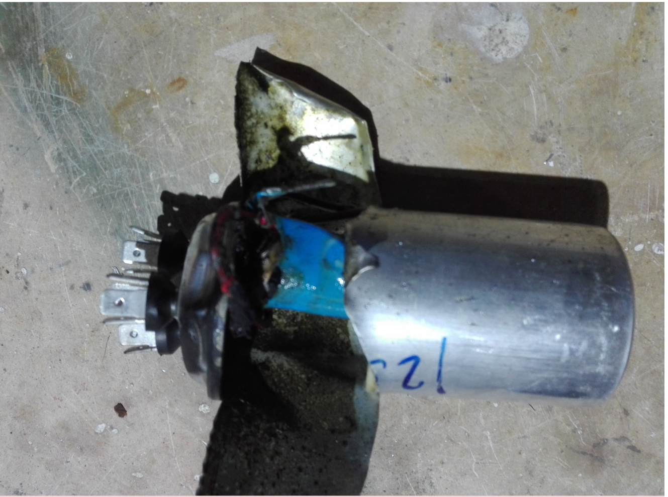
mbsm-dot-pro-capacitor-explodes- Pictures-B.jpg (1 MB)