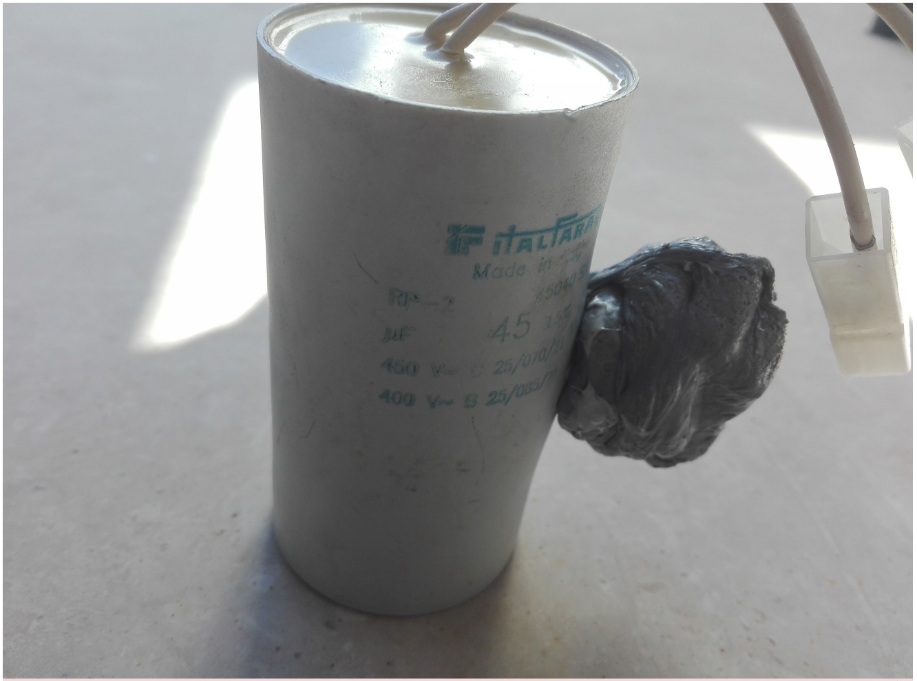
mbsm-dot-pro-capacitor-explodes- Pictures-F.jpg (748 KB)