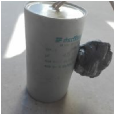
mbsm-dot-pro-capacitor-explodes- Pictures-E.jpg (3 MB)