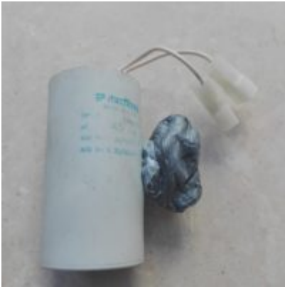
mbsm-dot-pro-capacitor-explodes- Pictures-H.jpg (2 MB)