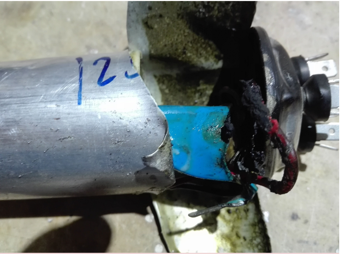
mbsm-dot-pro-capacitor-explodes- Pictures-D.jpg (1 MB)