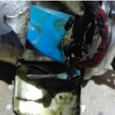
mbsm-dot-pro-capacitor-explodes- Pictures-G.jpg (2 MB)