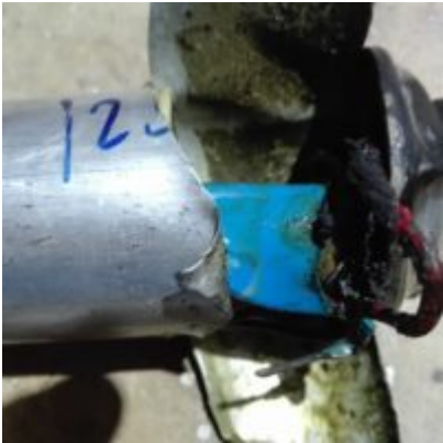
mbsm-dot-pro-capacitor-explodes- Pictures-F.jpg (2 MB)