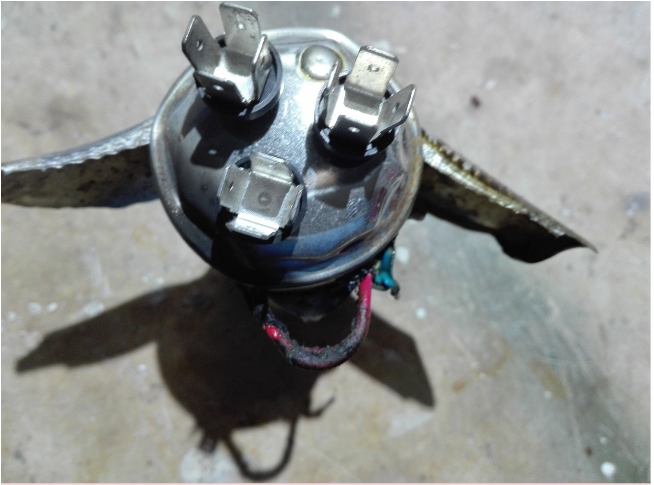
mbsm-dot-pro-capacitor-explodes- Pictures-C.jpg (1 MB)