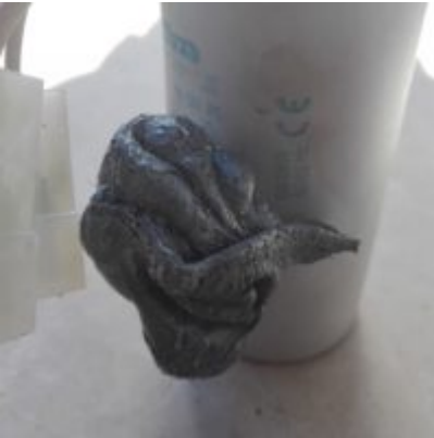
mbsm-dot-pro-capacitor-explodes- Pictures-I.jpg (2 MB)