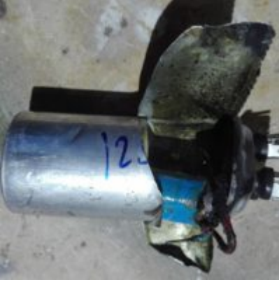
mbsm-dot-pro-capacitor-explodes- Pictures-B.jpg (3 MB)