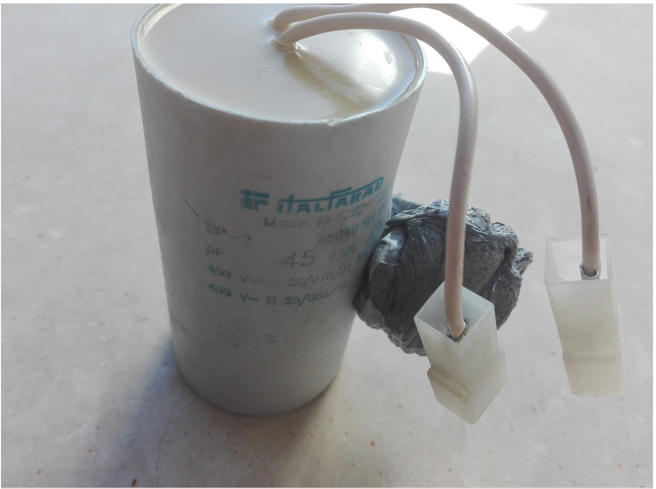
mbsm-dot-pro-capacitor-explodes- Pictures-J.jpg (739 KB)