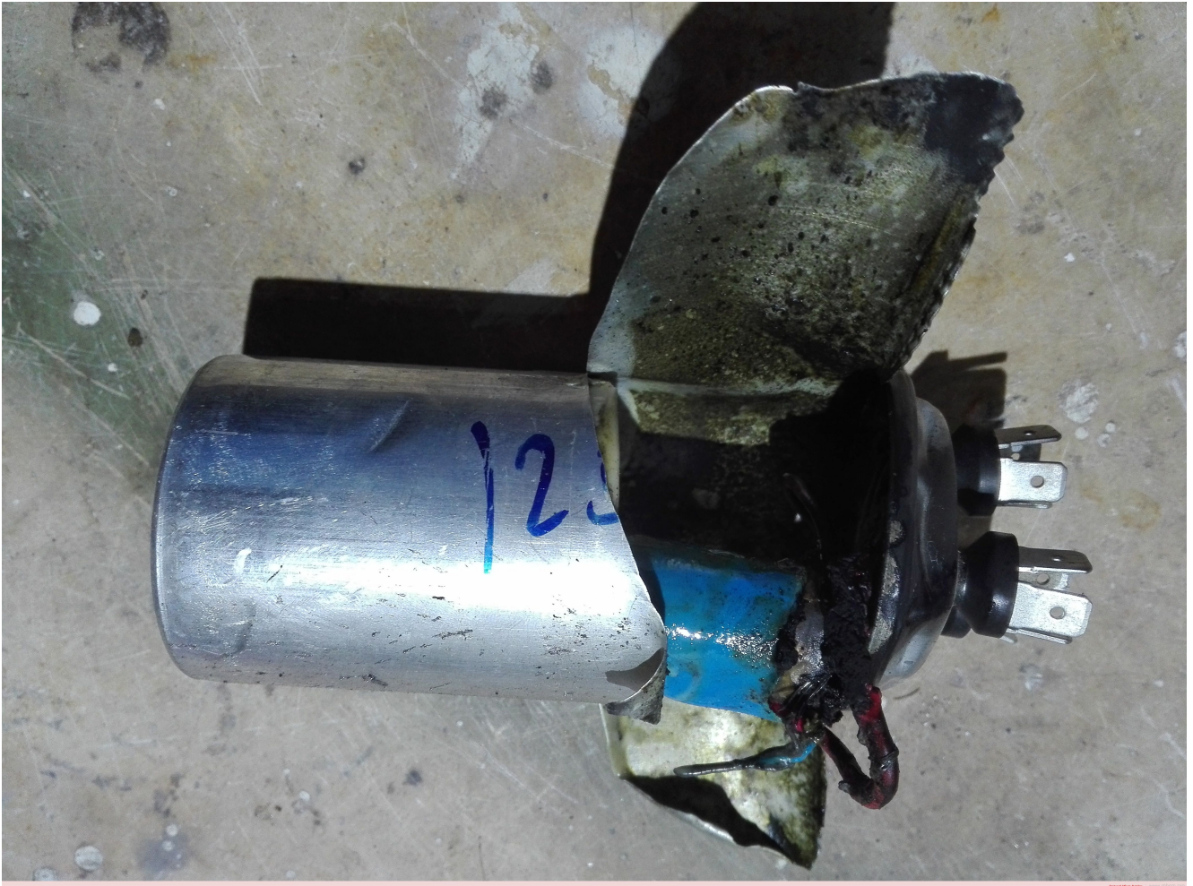
mbsm-dot-pro-capacitor-explodes- Pictures-A.jpg (1 MB)