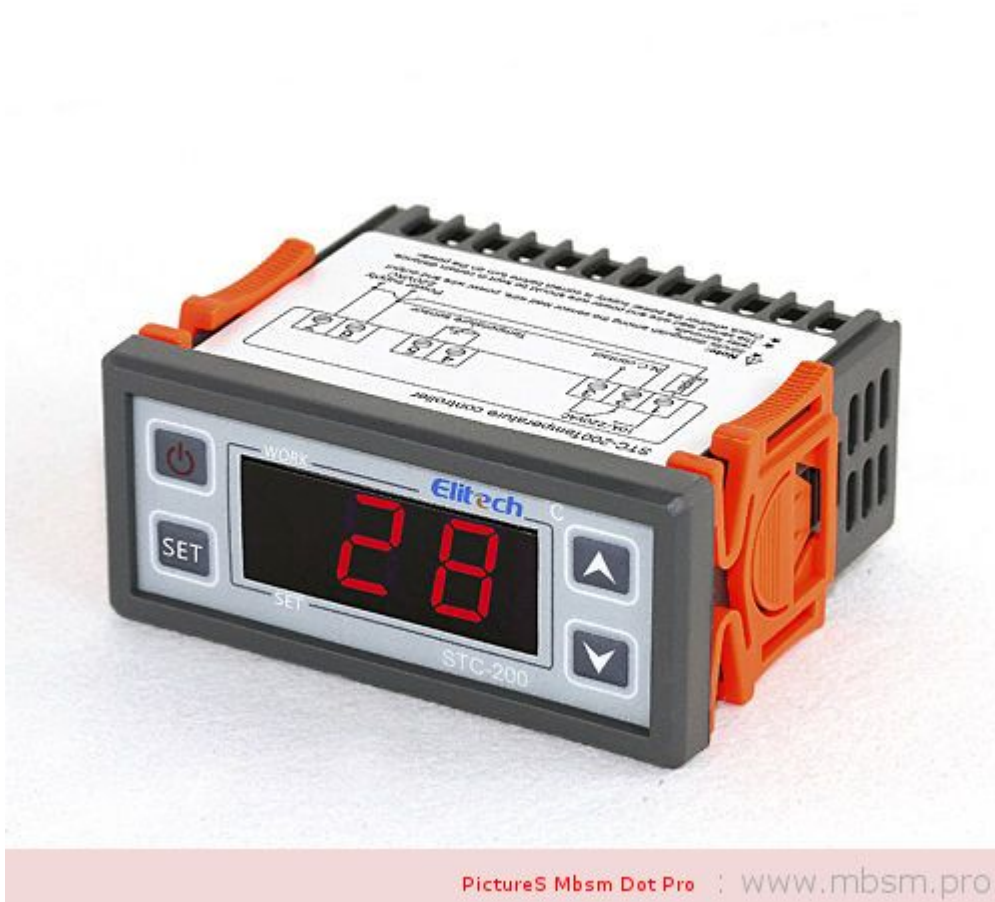
mbsmdotpro-regulateur (2).jpg (36 KB)