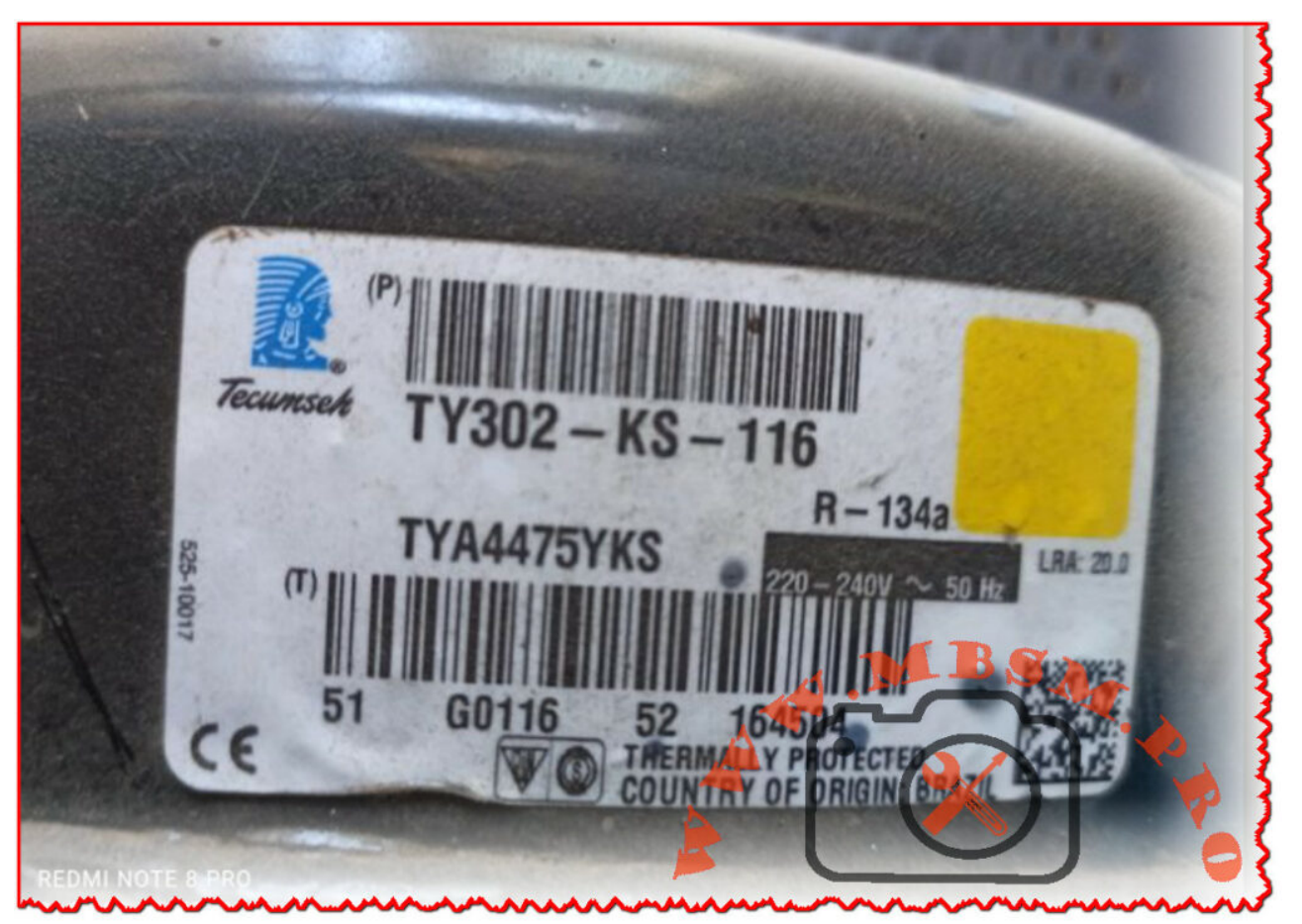
Mbsm.pro, Compressor, TYA4475YKS, Tecumseh, TYA 4475 YKS, TY302-KS-116, 3/4 hp, hbp, r134

Mbsm.pro, Compressor, THB1360YNS, Tecumseh, hermetic compressor, Thb1360y, R-134a, 1/5 hp, 230v, lbp