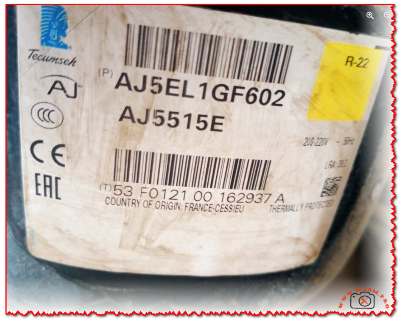
Mbsm.pro, AJ5515E-FZ3C, AJ5515E, AJ5EL1GF602 , Tecumseh, 1-1/4 hp, R22, Tecumseh compressor, Hermetic piston

Category: compressor written by Lilianne | 5 March 2025