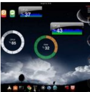
mbsm_dot_pro_ubuntu2.jpg (436 KB)