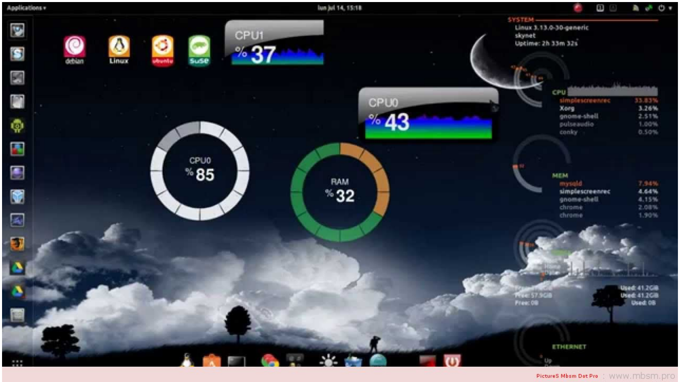
mbsm_dot_pro_ubuntu1.jpg (76 KB)